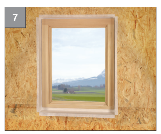
How it should look:

• Window frame joined airtight to timber wall construction