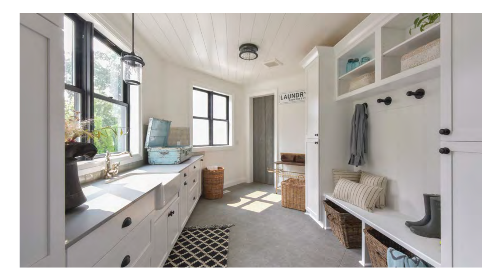
Window treatments by Window-ology. window-ology.net

These 24-inch-by-24-inch tiles on floor in "Dark Gray" with winter gray grout, and D,C,&K Texture Mix in color "W92" backsplash, both from Dwellings. dwellings.design. Shiplap ceiling from Metrie. metrie.com. Farm sink and faucet by Keller Supply Co. kellersupply.com. Dekton XGloss Solid counters in color "Blaze" from Valley Fabricators. valleyfab.com. Huntwood cabinets are in "Colonial White Satin Sheen." seattle.huntwood.com