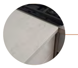
Silestone by Cosentino Eternal Series counters in "Eternal Serena" by Valley Fabricators. valleyfab.com