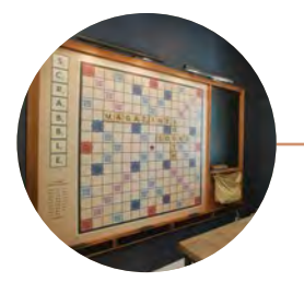
Glass doors by Simpson Door Co. simpsondoor. com. Blue Ralph Lauren wall coverings from Kravet. kravet.com. Giant Scrabble Board from Restoration Hardware. restorationhardware.com. Antique desk from Tree. tree.co