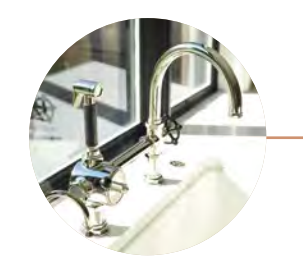
Farm Sink from Keller Supply Co. kellersupply.com. "Waterworks" sink faucet and pot-filler by Chown Hardware. chown.com