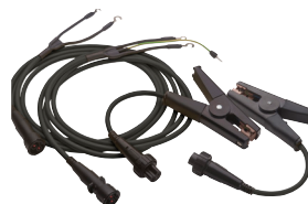
+ KC1 Kelvin clip 3 m leads