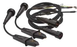
+ DH4-C probe 1.5 m leads