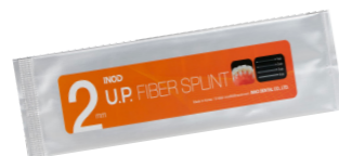
U.P. Fiber Splint #2 2mm x 20cm x 2pcs