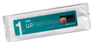
U.P. Fiber Splint #1 1mm x 20cm x 2pcs