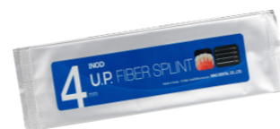
U.P. Fiber Splint #4 4mm x 20cm x 2pcs