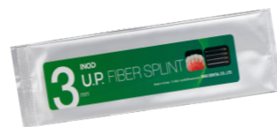
U.P. Fiber Splint #3 3mm x 20cm x 2pcs