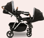
+ 2 Infant Seat Inserts