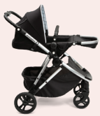
+ Infant Seat Insert

From birth, until your child can support their head and start pushing themselves up (usually around 4-6 months)