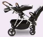
+ Infant Seat Insert