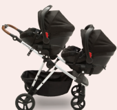
+ 2 Car Seat Adapters

Our Stroller does not currently support the use of two Carriages