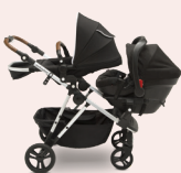
+ Infant Seat Insert + Car Seat Adapter