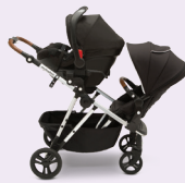
+ Car Seat Adapter