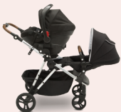
+ Car Seat Adapter + Infant Seat Insert