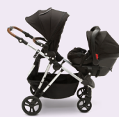
+ Car Seat Adapter