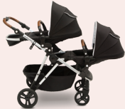
+ 2 Infant Seat Inserts