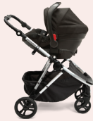
+ Car Seat Adapter