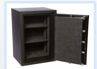
3 Way Locking