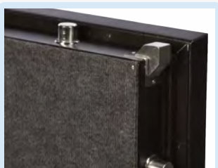
Unique Corner Bolts