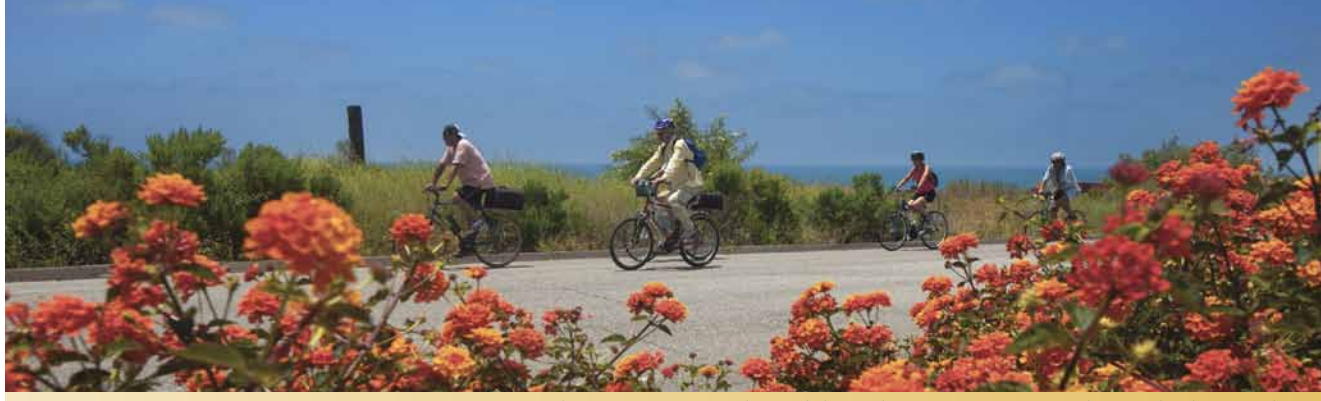
Bicyclists frequent the Old Highway 101 route through the park.

Day Use —Two of the state's most popular surfing beaches attract