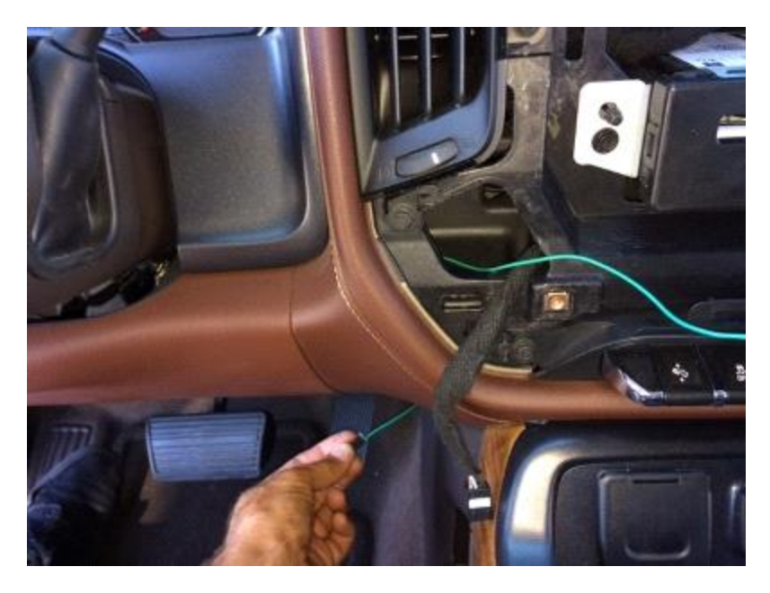
Step 14: Reinstall radio screen and trim