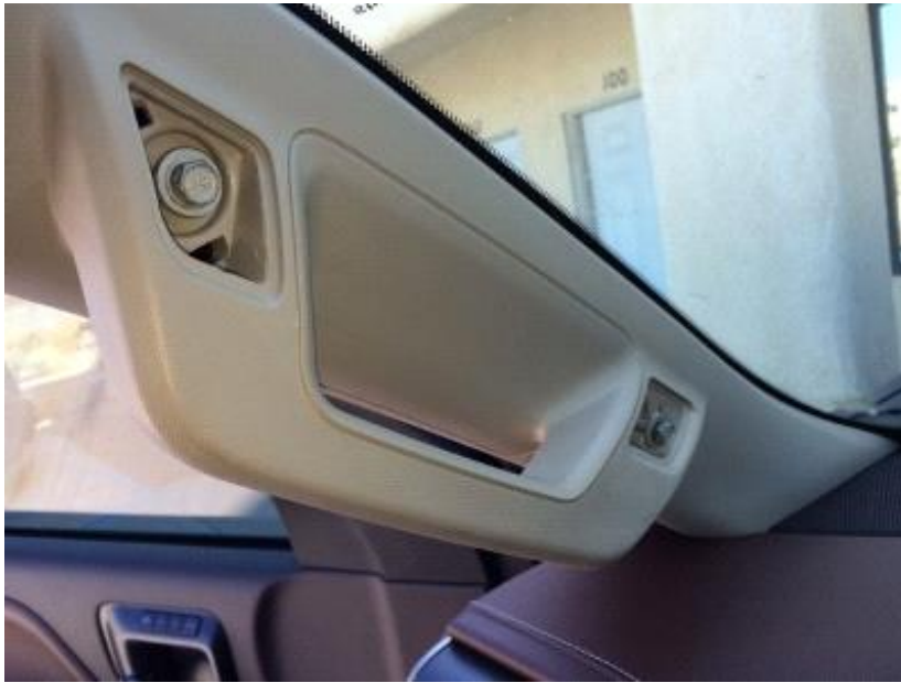
Step 7: Remove A-pillar trim by pulling out and up