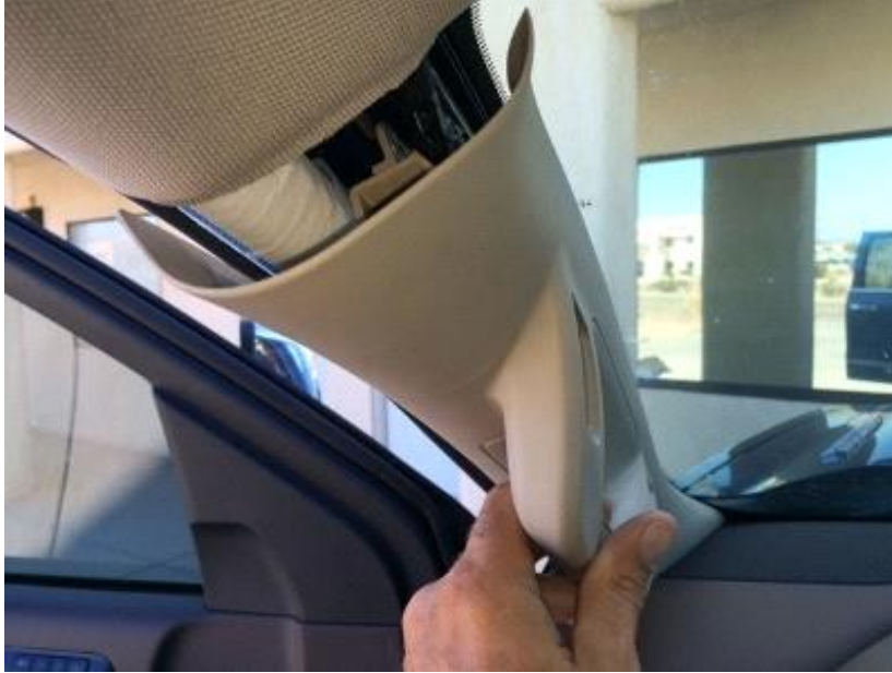
Step 8: Remove side panel trim plastic pry tool