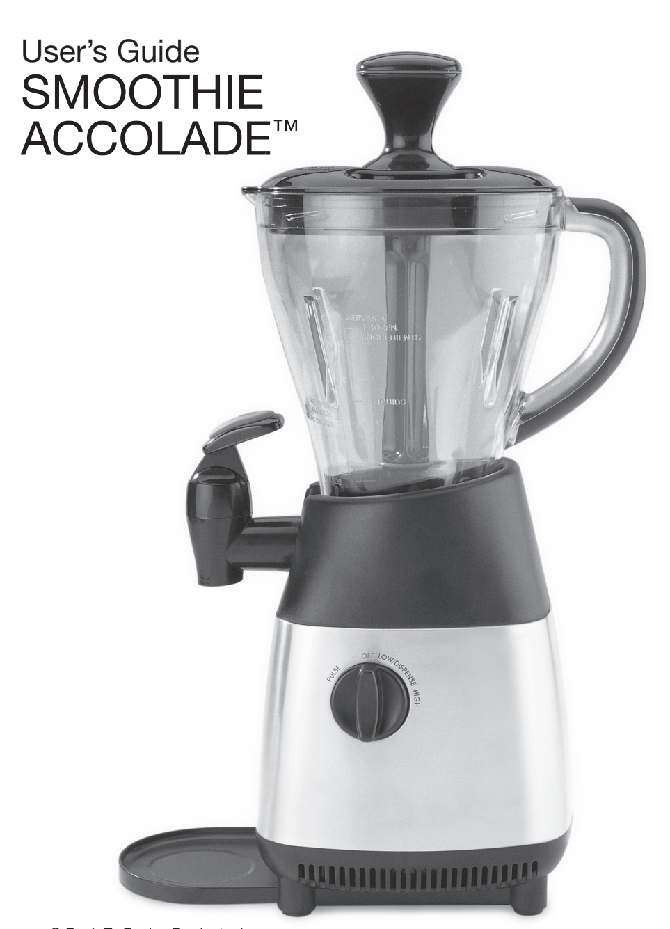
© Back To Basics Products, Inc.