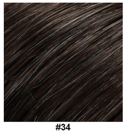
Darkest Brown with 5%-10% Gray Mixed