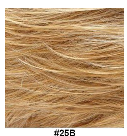
Medium Golden Blonde