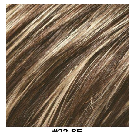
#22-0F Medium Warm Brown with Light Ash Blonde Highlights