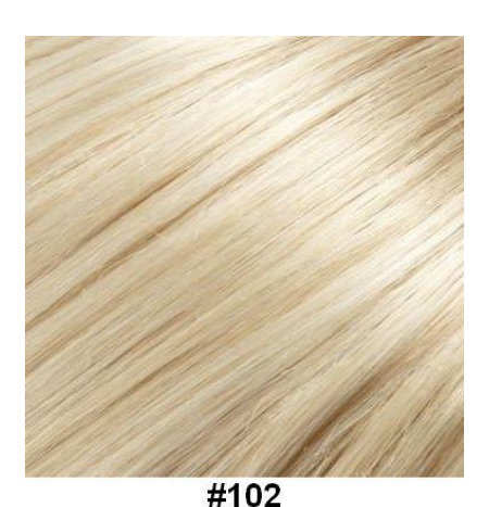
#102 Pale White Blonde