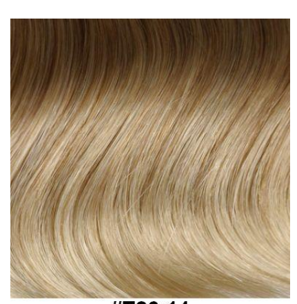
#T26-14 Dark Sandy Blonde Roots with Light Blonde Ends