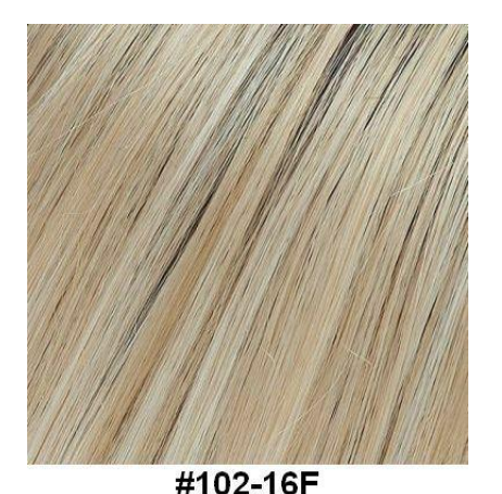
Medium Ash Blonde with Pale White Blonde Highlights