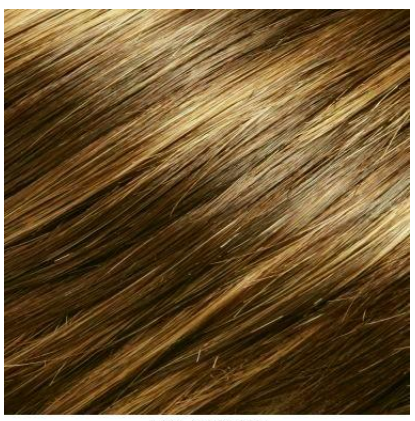
#9-27BF Light Brown with Golden Warm Blonde Highlights