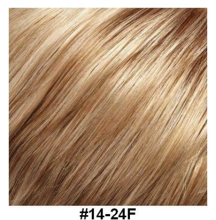
Dark Sandy Blonde with Light Honey Blonde Highlights