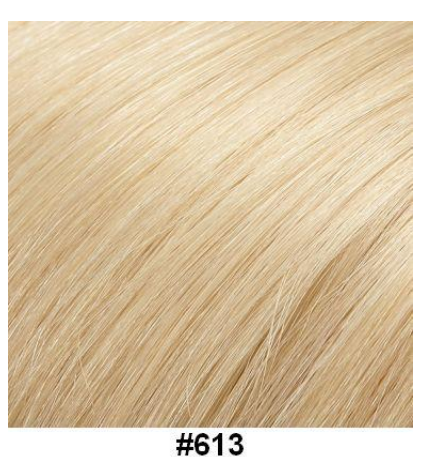
Very Light Blonde with Slight Hint of Yellow