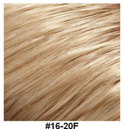
Medium Ash Blonde with Medium Honey Blonde Highlights