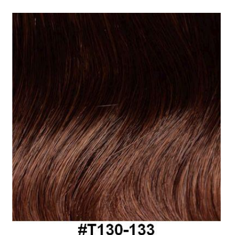
Darkest Red Roots with Bright Light Red Ends