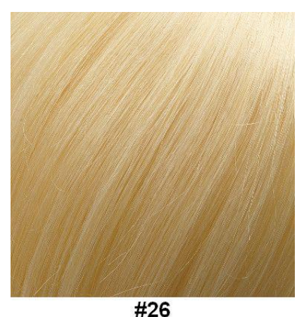
#∠ b Light Blonde