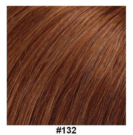
Medium Flame Red