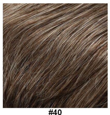
Light Ash Brown with 30% Gray Mixed