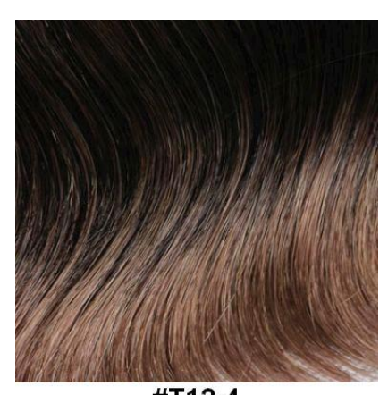
#T12-4 Dark Brown Roots with Light Brown Ends