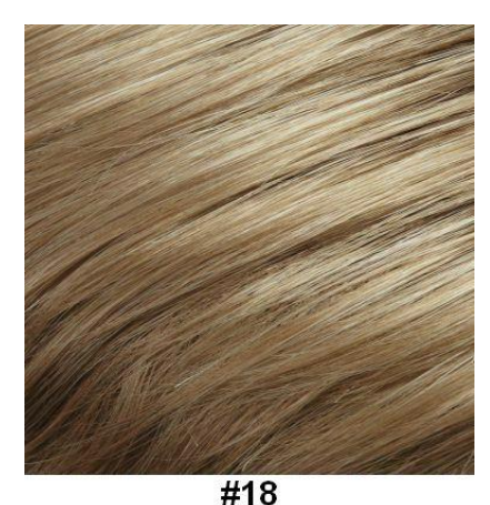
Dark Ash Blonde