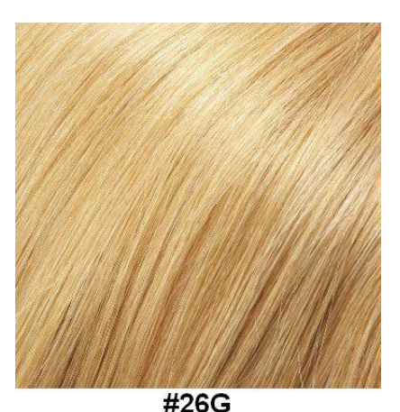
Rich Golden Blonde