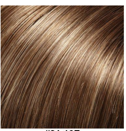
#24-10F Light Brown with Light Honey Blonde Highlights