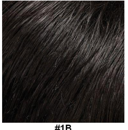
#1B Off Black