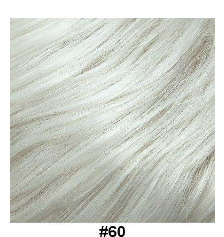
100% White Gray