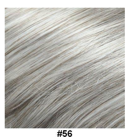
90% White/Gray with 10% Dark Brown Mix