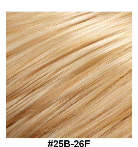
Medium Golden Blonde with Light Blonde Highlights