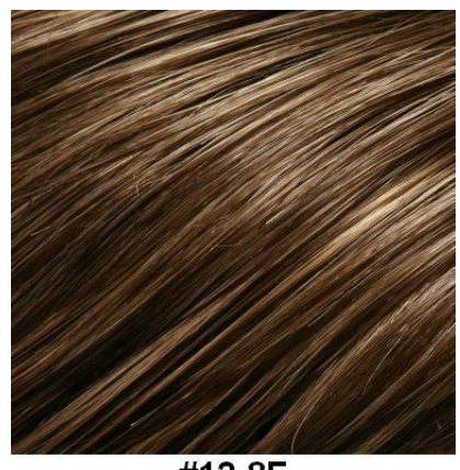
#12-8F Medium Warm Brown with Light Golden Brown Highlights