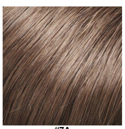
# 7A Medium Ash Brown