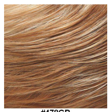
#478GR Light Reddish Blonde