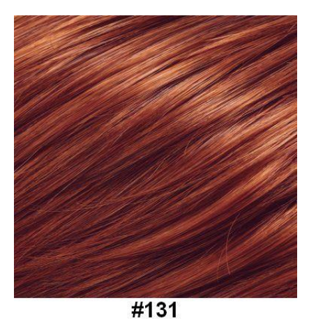
Brightest Flame Red