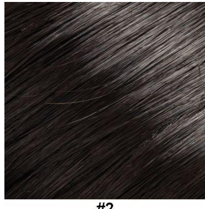
#2 Darkest Brown