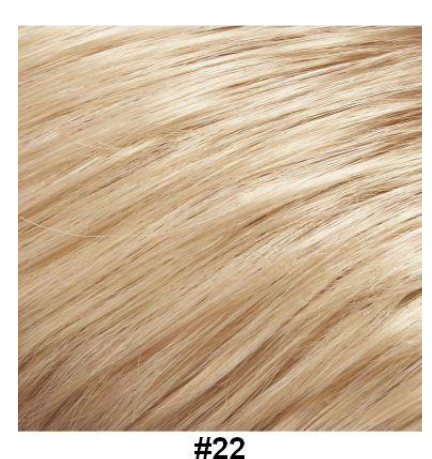
Light Ash Blonde