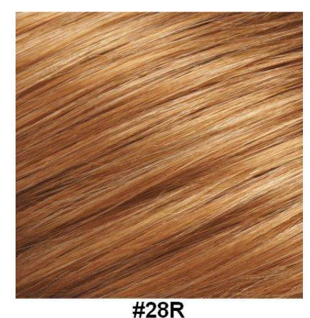
Light Strawberry Red with Gold Hue