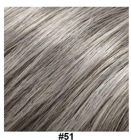
Light Brown with 60% Gray Mixed