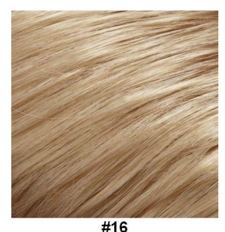
# I D Medium Ash Blonde