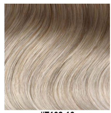
#T102-16 Medium Ash Blonde Roots with Pale White Blonde Ends