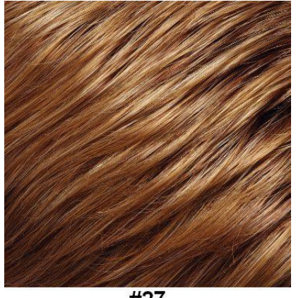
#27 Light Natural Red