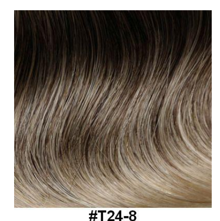
Medium Brown Roots with Light Honey Blonde Ends