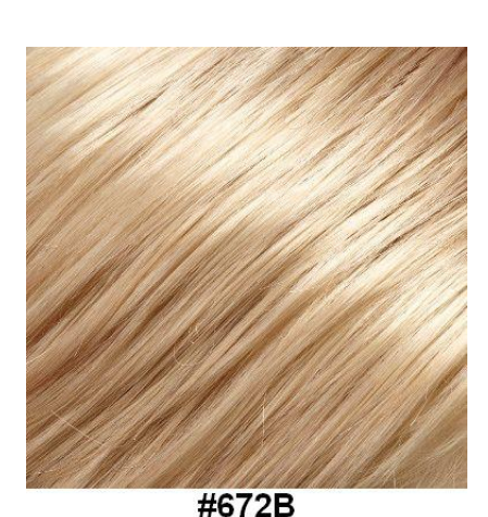
Multi-Toned Light Blonde Blend