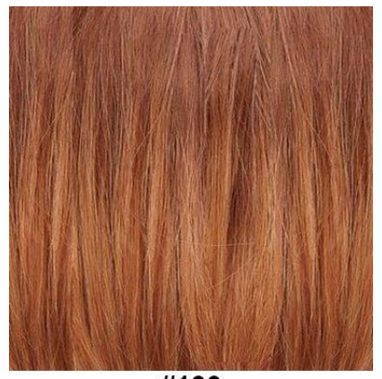
#130 Bright Light Red