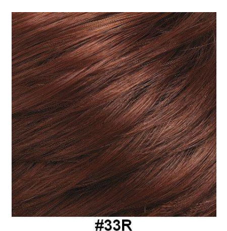
Medium Cellophane Bright Red