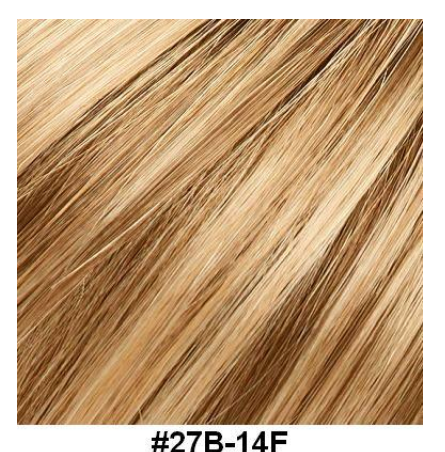
#2/ D-14F Sandy Medium Blonde with Dark Golden Blonde Highlights