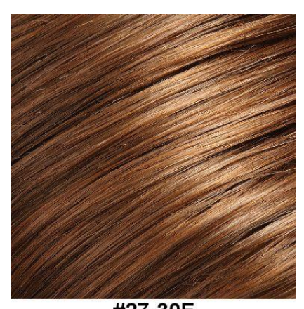
#27-30F Light Natural Red with Natural Medium Red Blend