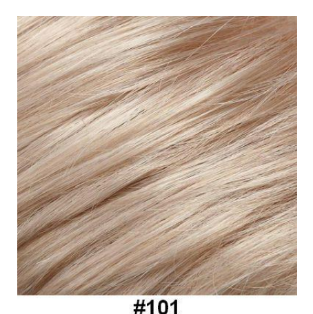
Platinum Light Blonde