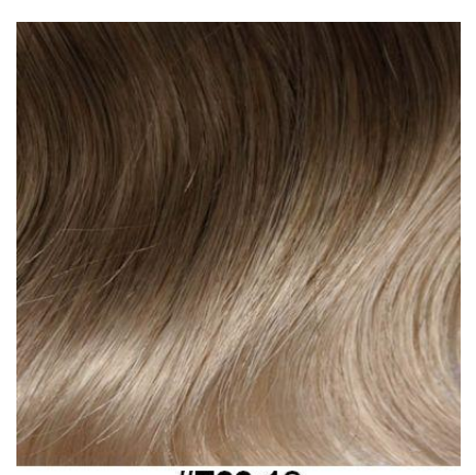
#T22-18 Dark Ash Blonde Roots with Light Ash Blonde Ends