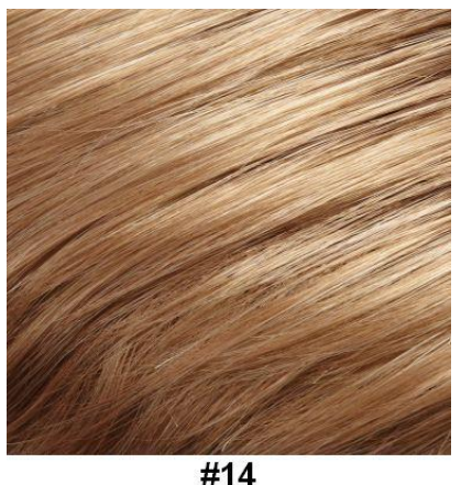
#14 Dark Sandy Blonde