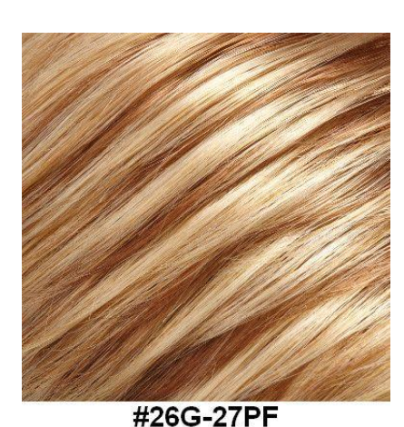
Rich Golden Blonde with Light Natural Red Highlights