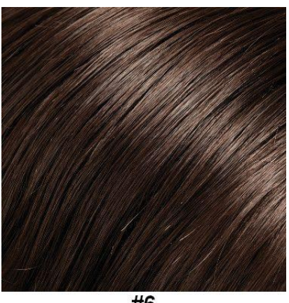
#6 Medium Brown