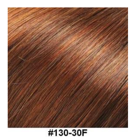
Bright Light Red with Natural Medium Red Highlights