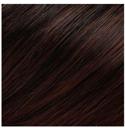
#133-2F Darkest Brown with Dark Berrywood Red Highlights