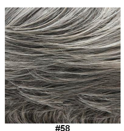
80% Slate Gray with 20% Dark Brown Mixed