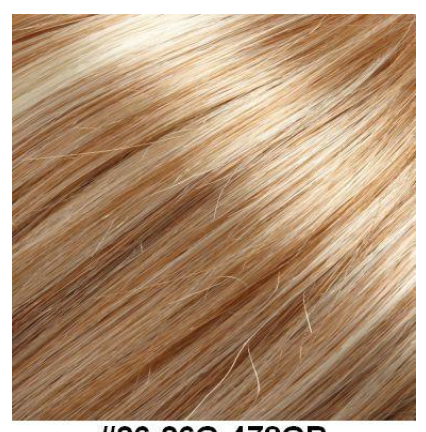
#26-26G-478GR Blend of Light Blonde, Rich Golden Blonde and Light Reddish Blonde