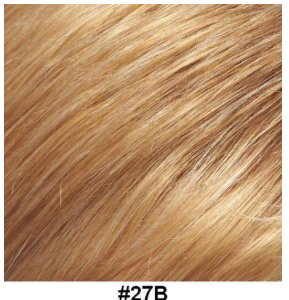
#21 D Dark Golden Blonde