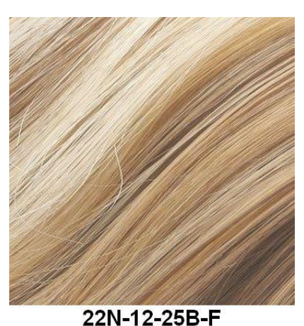
3-Color Blend: Light Golden Brown with Pale Light Blonde & Medium Golden Blonde