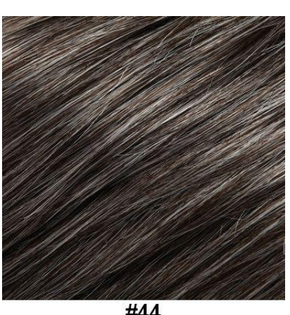
Dark Brown with 50% Gray Mixed