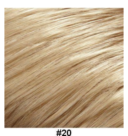
Medium Honey Blonde