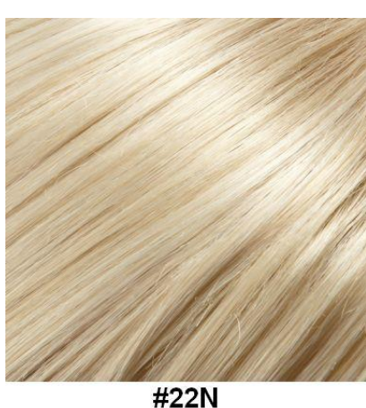
Pale Light Blonde with Beige Undertone