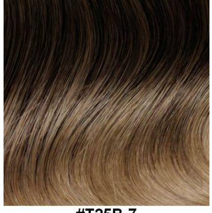
#T25B-7 Medium Brown Roots with Golden Blonde Ends