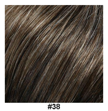
Medium Brown with 30%-40% Gray Mixed