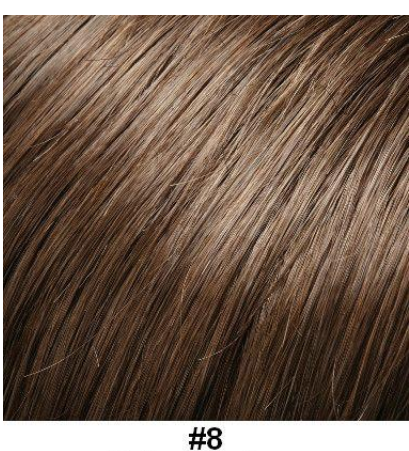
Medium Warm Brown