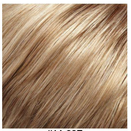
#14-22F Dark Sandy Blonde with Light Ash Blonde Highlights