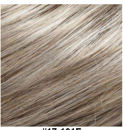
#17-101F Ash Blonde with Platinum Blonde Highlights