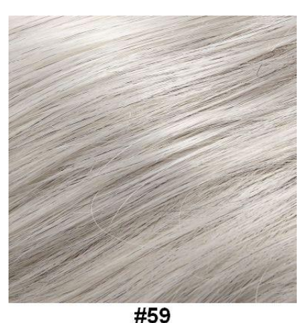
Light Blonde Gray with 5% Light Brown Mixed