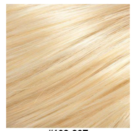
#102-26F Light Blonde with Pale White Blonde Highlights