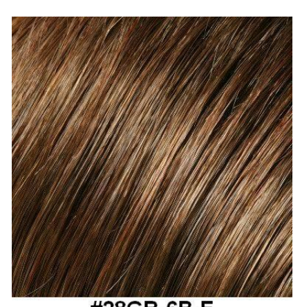
#28GR-6B-F Medium Brown with Medium Gold Red Highlights