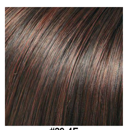
#29-4F Medium/Dark Brown with Light Auburn Highlights