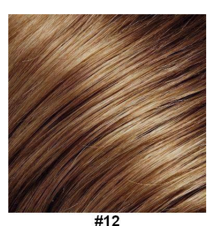
Light Golden Brown