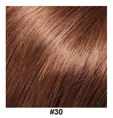
Natural Medium Red