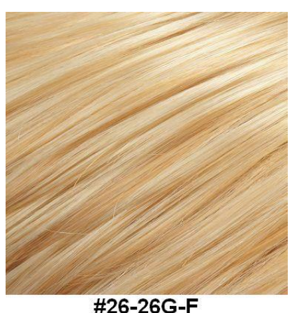
#20-20G-F Light Blonde with Rich Golden Blonde Blend