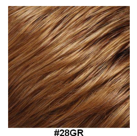
Medium Red with Gold Blend