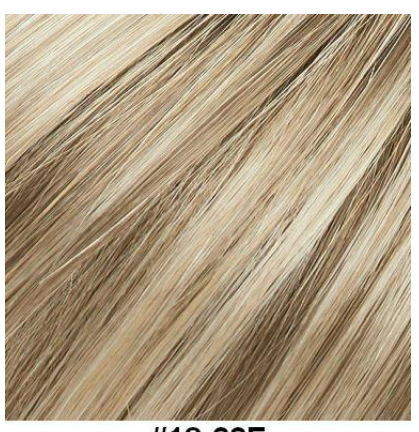
#18-22F Dark Ash Blonde with Light Ash Blonde Highlights