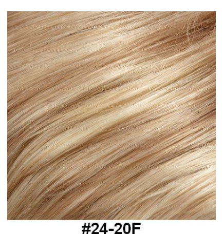
Medium Honey Blonde with Light Honey Blonde Highlights