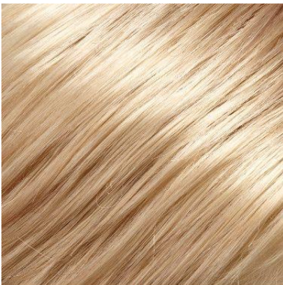
#672B Multi-Toned Light Blonde Blend