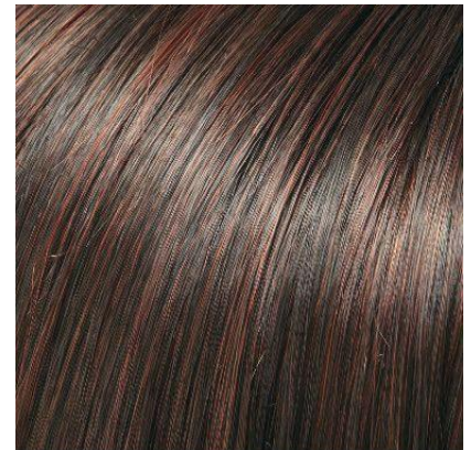
#29-4F Medium/Dark Brown with Light Auburn Highlights