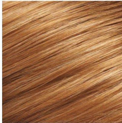
#28R Light Strawberry Red with Gold Hue