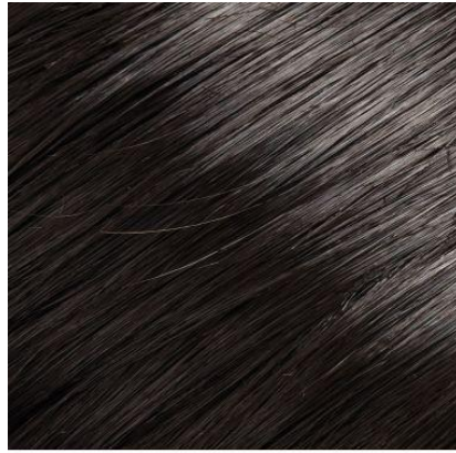
#2 Darkest Brown