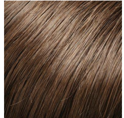
#8 Medium Warm Brown