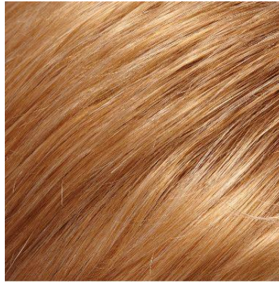
#27G Strawberry Blonde