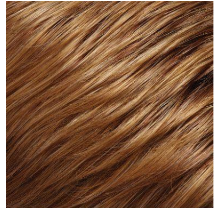
#28GR Medium Red with Gold Blend