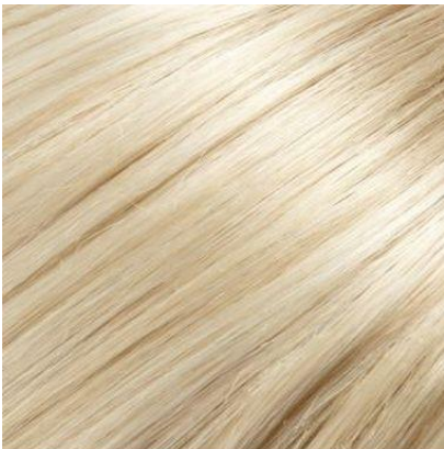
#102 Pale White Blonde