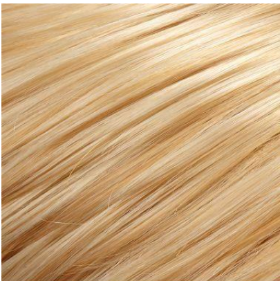
#25B-26F Medium Golden Blonde with Light Blonde Highlights