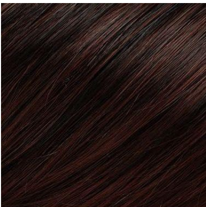
#133-2F Darkest Brown with Dark Berrywood Red Highlights