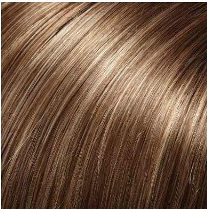
#24-10F Light Brown with Light Honey Blonde Highlights