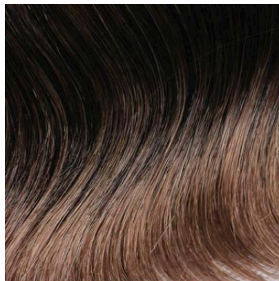
#T12-4 Dark Brown Roots with Light Brown Ends