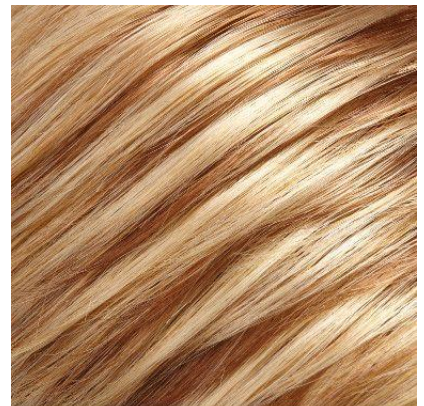
#26G-27PF Rich Golden Blonde with Light Natural Red Highlights