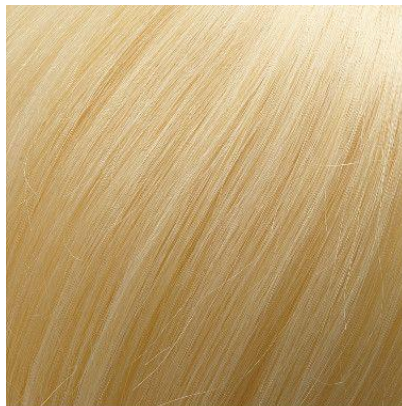
#26 Light Blonde