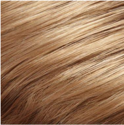
#14 Dark Sandy Blonde