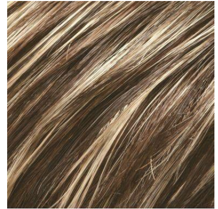
#22-8F Medium Warm Brown with Light Ash Blonde Highlights