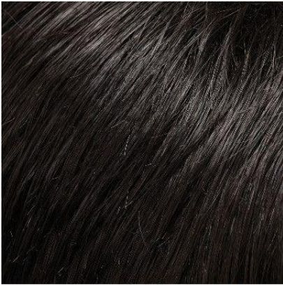
#1B Off Black