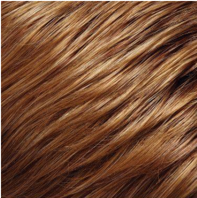
#27 Light Natural Red