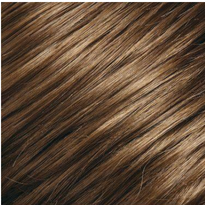
#10 Light Brown