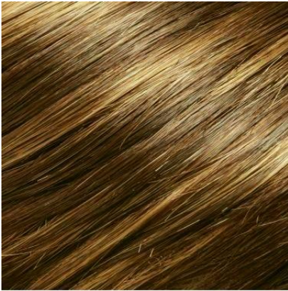
#9-27BF Light Brown with Golden Warm Blonde Highlights