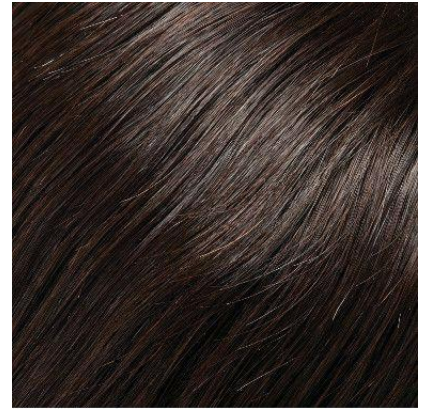
#4 Medium/Dark Brown