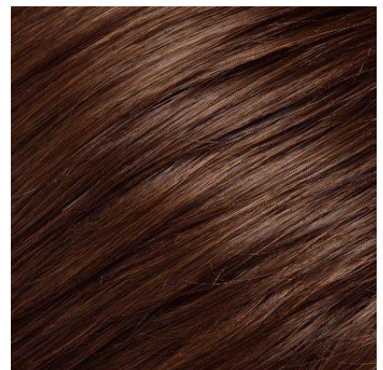
#32 Deep Auburn