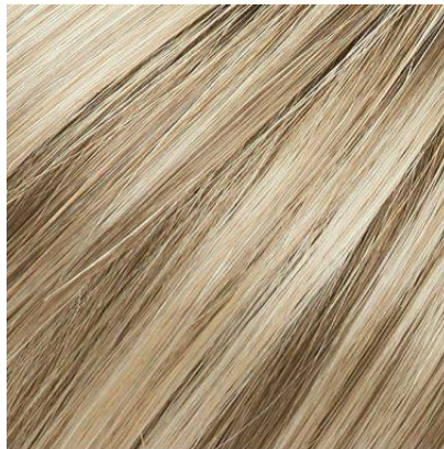
#18-22F Dark Ash Blonde with Light Ash Blonde Highlights