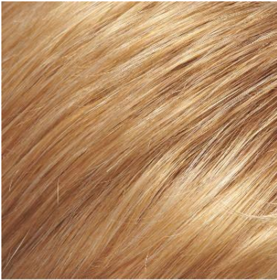
#27B Dark Golden Blonde