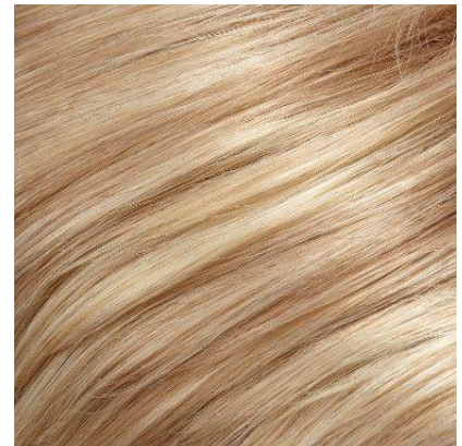
#24-20F Medium Honey Blonde with Light Honey Blonde Highlights