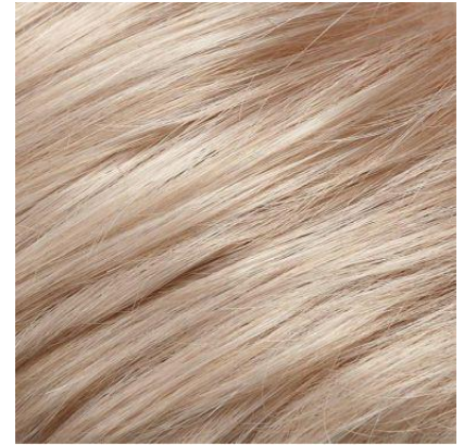
#101 Platinum Light Blonde