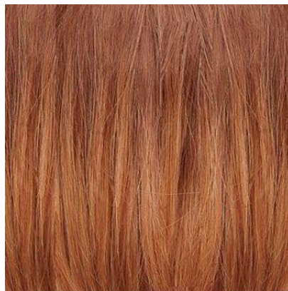
#130 Bright Light Red