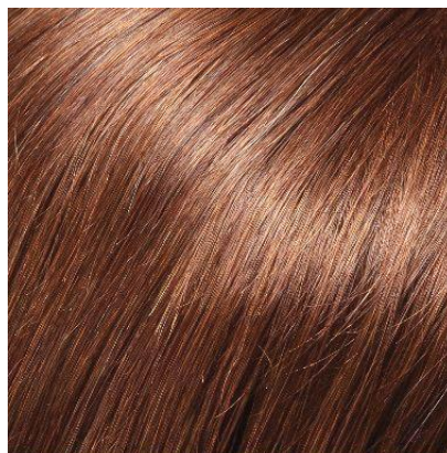
#30 Natural Medium Red