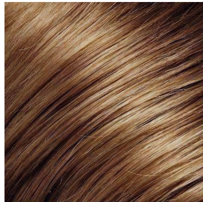
#12 Light Golden Brown