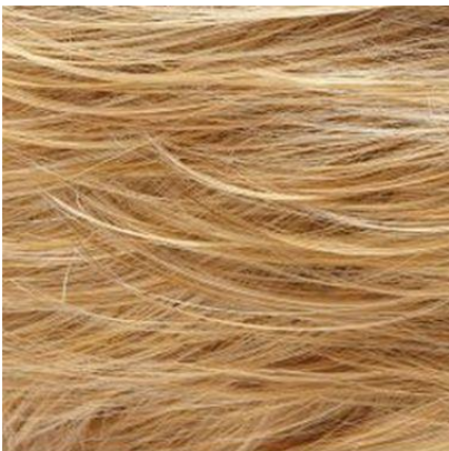
#25B Medium Golden Blonde