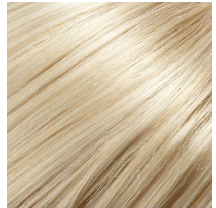
#22N Pale Light Blonde with Beige Undertone