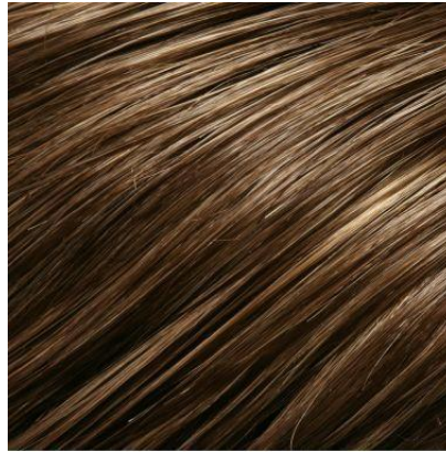
#12-8F Medium Warm Brown with Light Golden Brown Highlights