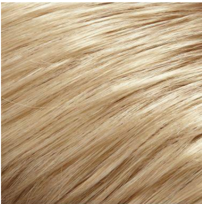
#20 Medium Honey Blonde