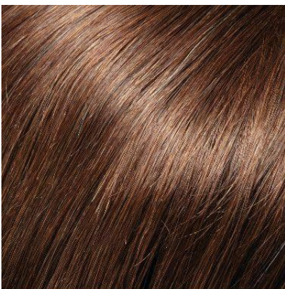
#29 Light Auburn