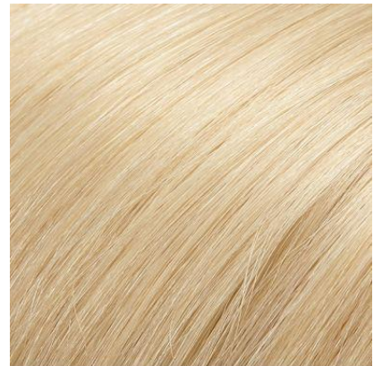
#613 Very Light Blonde with Slight Hint of Yellow