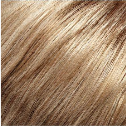
#14-22F Dark Sandy Blonde with Light Ash Blonde Highlights