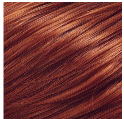
#131 Brightest Flame Red