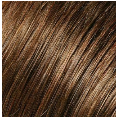
#28GR-6B-F Medium Brown with Medium Gold Red Highlights