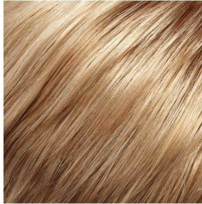
#14-24F Dark Sandy Blonde with Light Honey Blonde Highlights