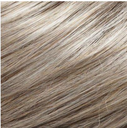
#17-101F Ash Blonde with Platinum Blonde Highlights