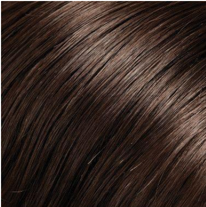
#6 Medium Brown