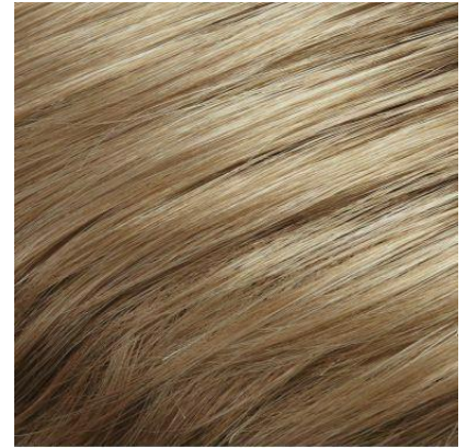
#18 Dark Ash Blonde