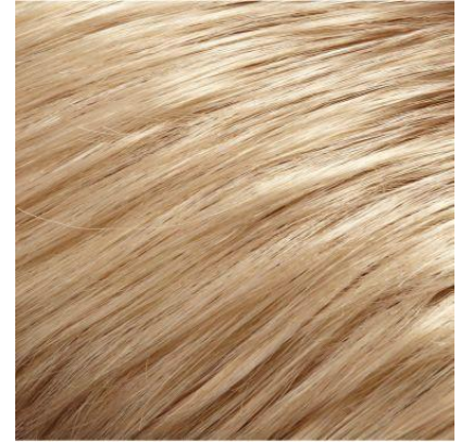
#16-20F Medium Ash Blonde with Medium Honey Blonde Highlights