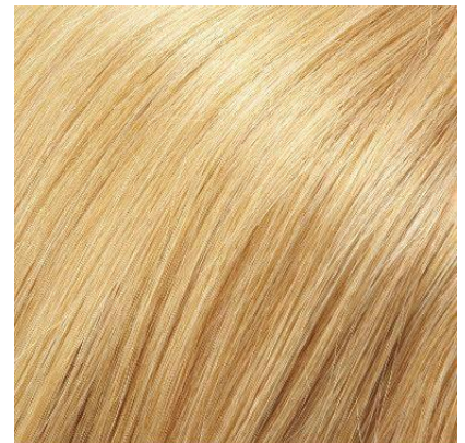
#26G Rich Golden Blonde