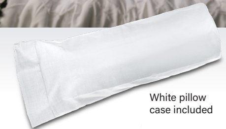
White pillow case included