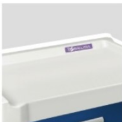
ABS top surface Light, easy to clean.