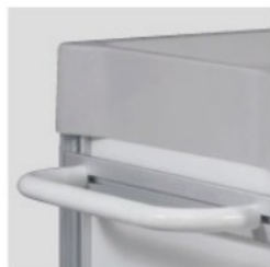
Push handle User friendly design, height adjustable, easy set up.