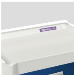
ABS top surface Light, easy to clean.