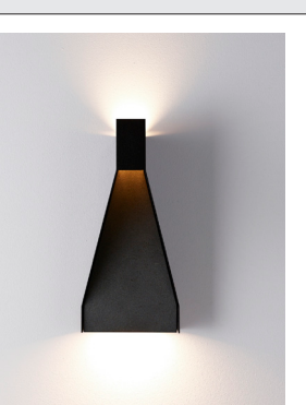
Black Powdercoat // Bluestone