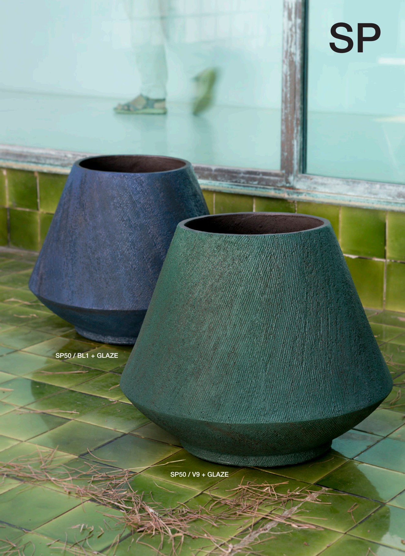
SP50 / BL1 + GLAZE