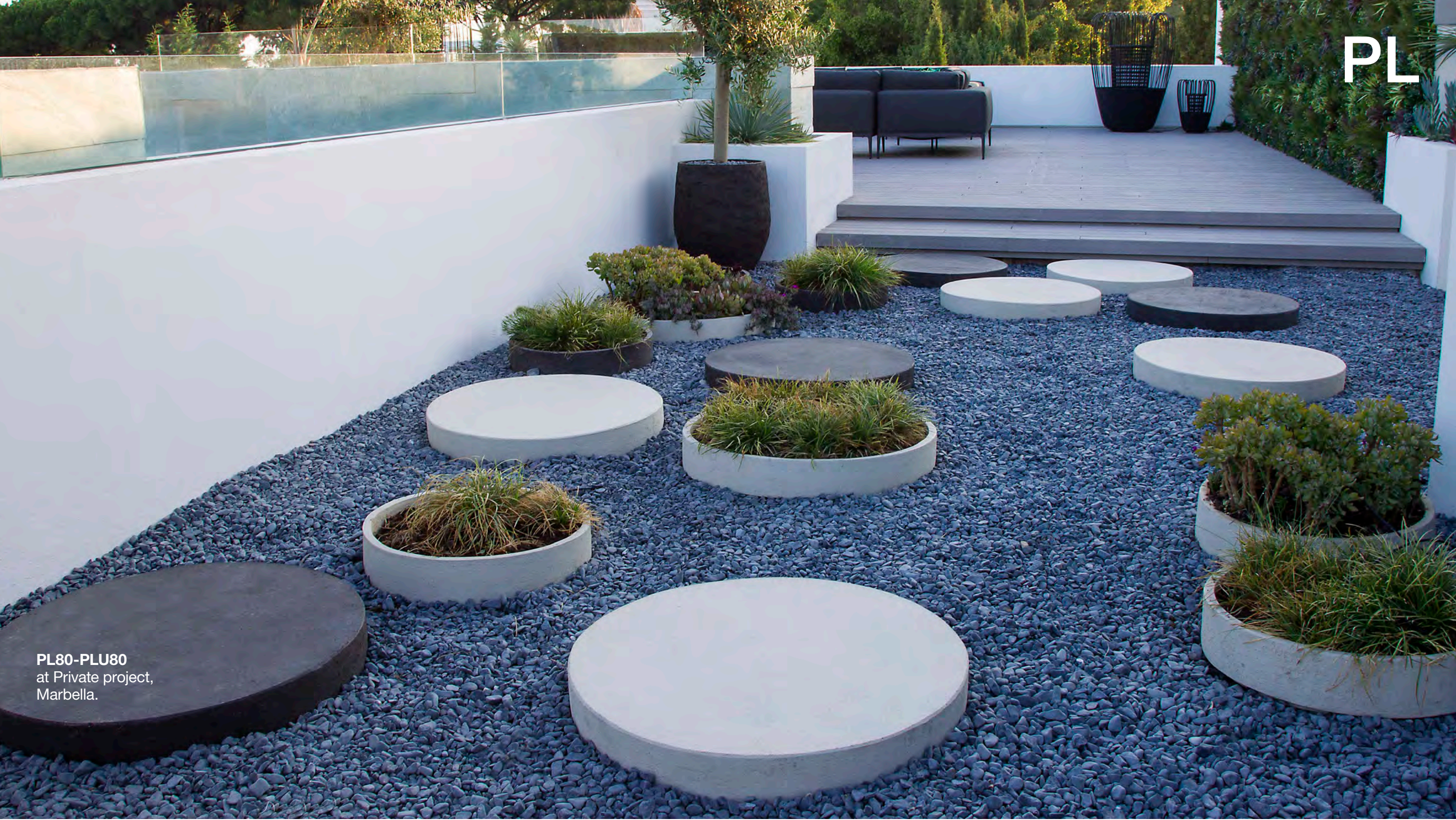
PL80-PLU80 at Private project, Marbella.