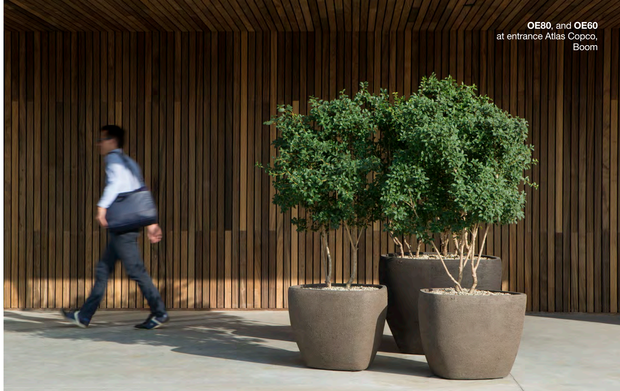
OE80, and OE60 at entrance Atlas Copco, Boom