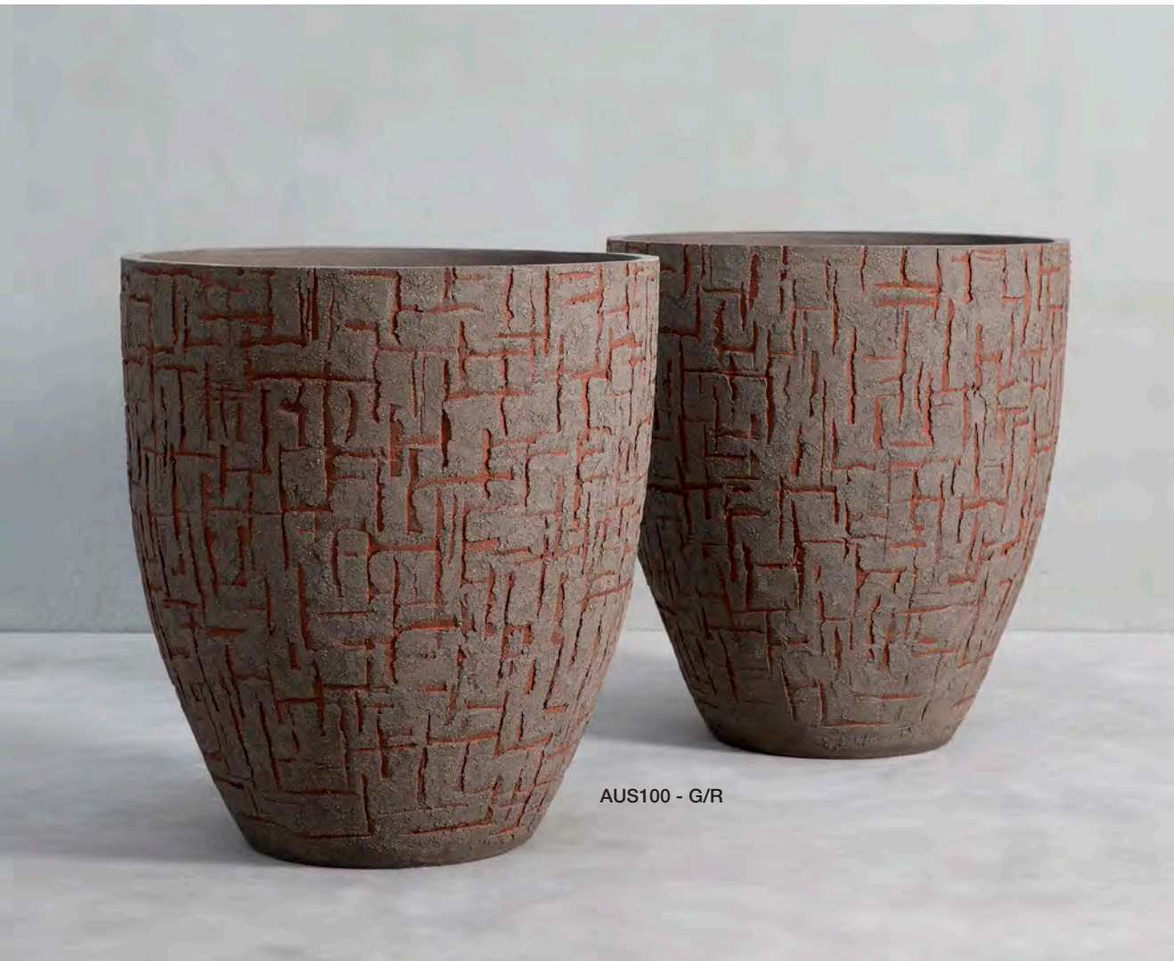
AUS100 - G/R