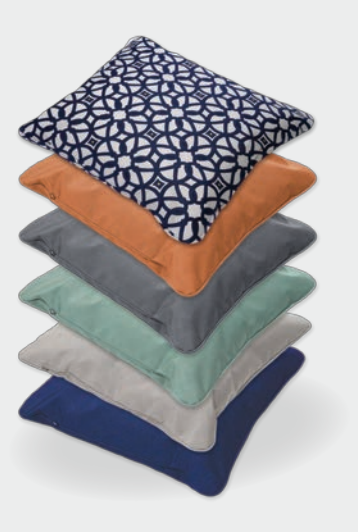
SUNBRELLA® THROW CUSHIONS