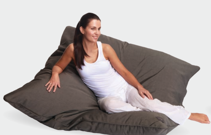
MARINE BEAN ATOLL 1500 mm x 1500 mm requires 360 litres of beans