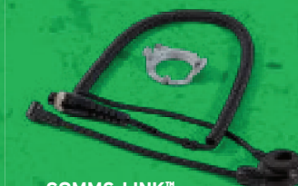
COMMS-LINK™ In-helmet communication system.