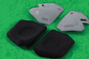
COMFORT-LINK™ Padding system.