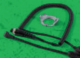
COMMS-LINK™ In-helmet communication system.