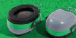
QUIET-LINK™ Ear defender system.