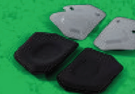
COMFORT-LINK™ Padding system.