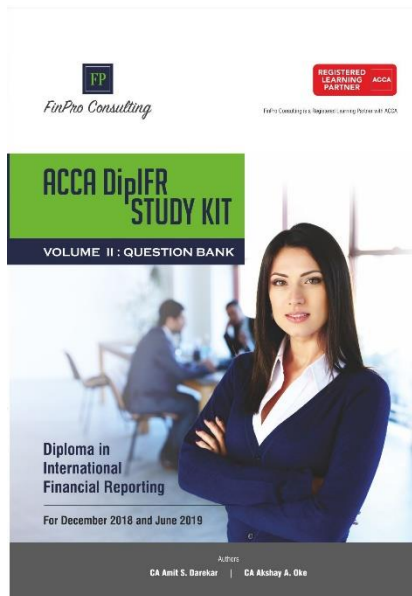
Volume II – Question Bank