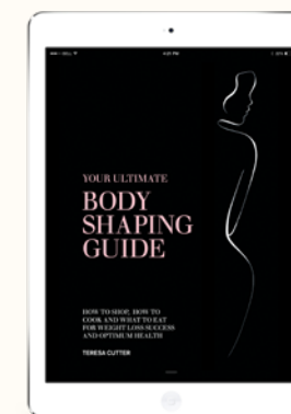
YOUR ULTIMATE BODY SHAPING GUIDE