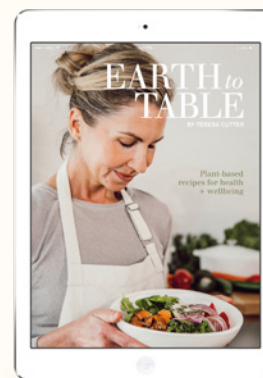
EARTH TO TABLE