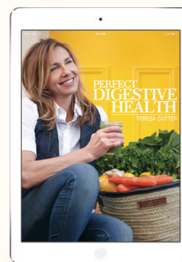
PERFECT DIGESTIVE HEALTH