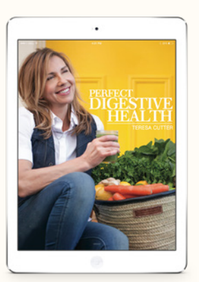
PERFECT DIGESTIVE HEALTH