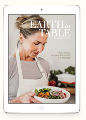
THE HEALTHY CHEF