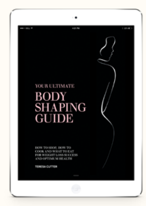
YOUR ULTIMATE BODY SHAPING GUIDE