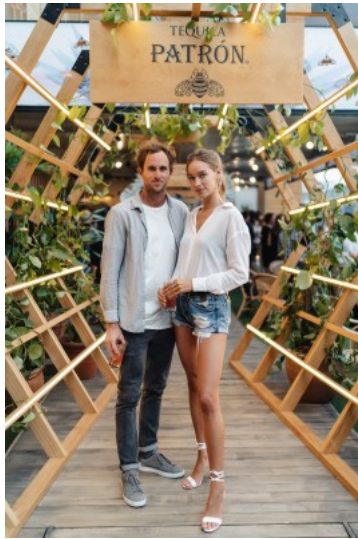
( https://www.socialdiary.com.au/party_pics/4636 )