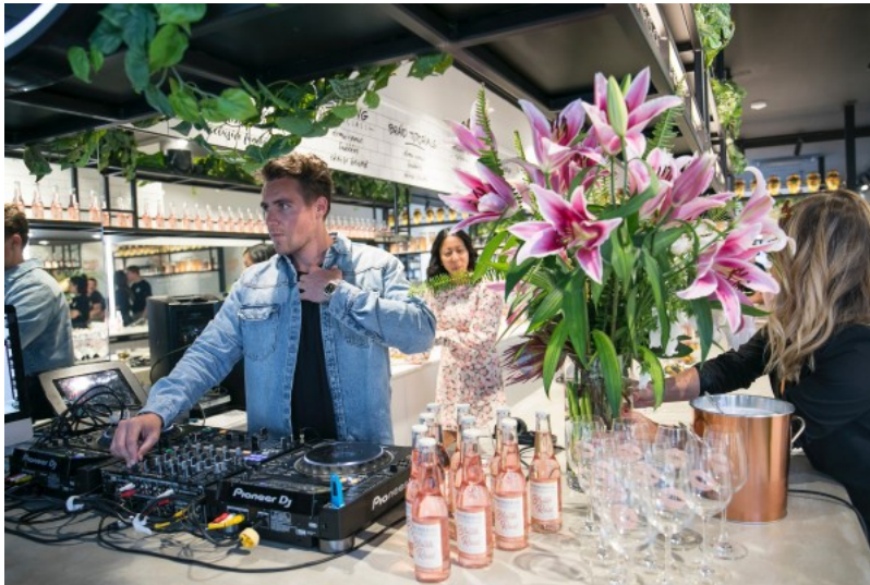
( https://www.socialdiary.com.au/party_pics/4638 )