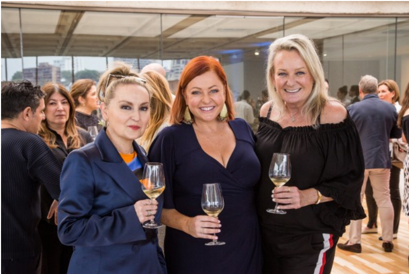
( https://www.socialdiary.com.au/party_pics/4637 )