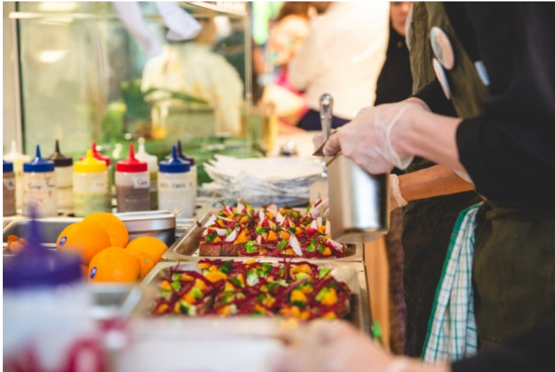
( https://www.socialdiary.com.au/party_pics/4635 )