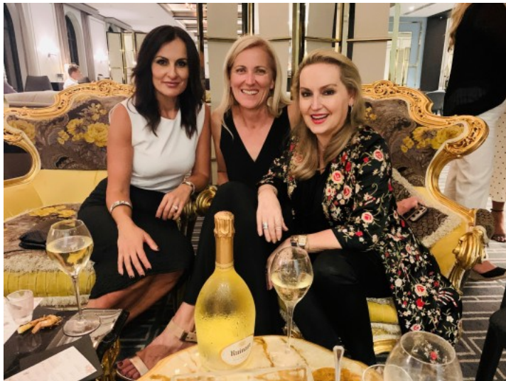
( https://www.socialdiary.com.au/party_pics/4641 )