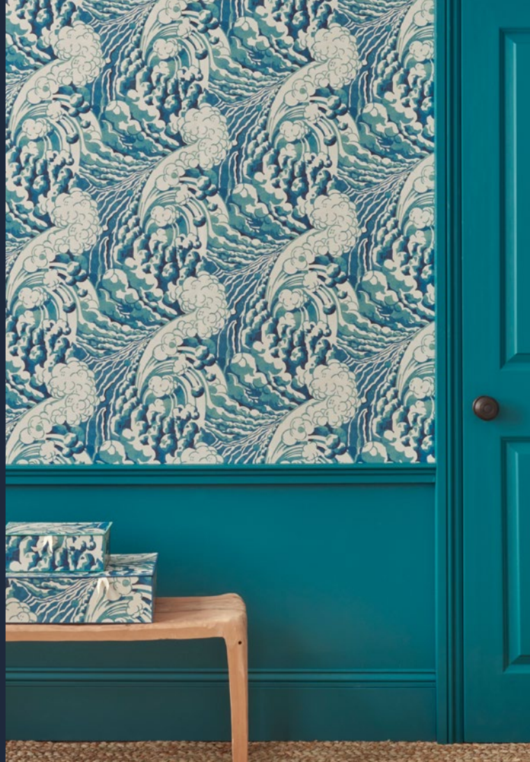
Wallpaper - The Wave