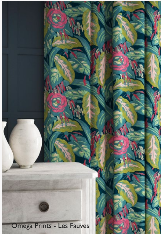
Omega Prints - Les Fauves