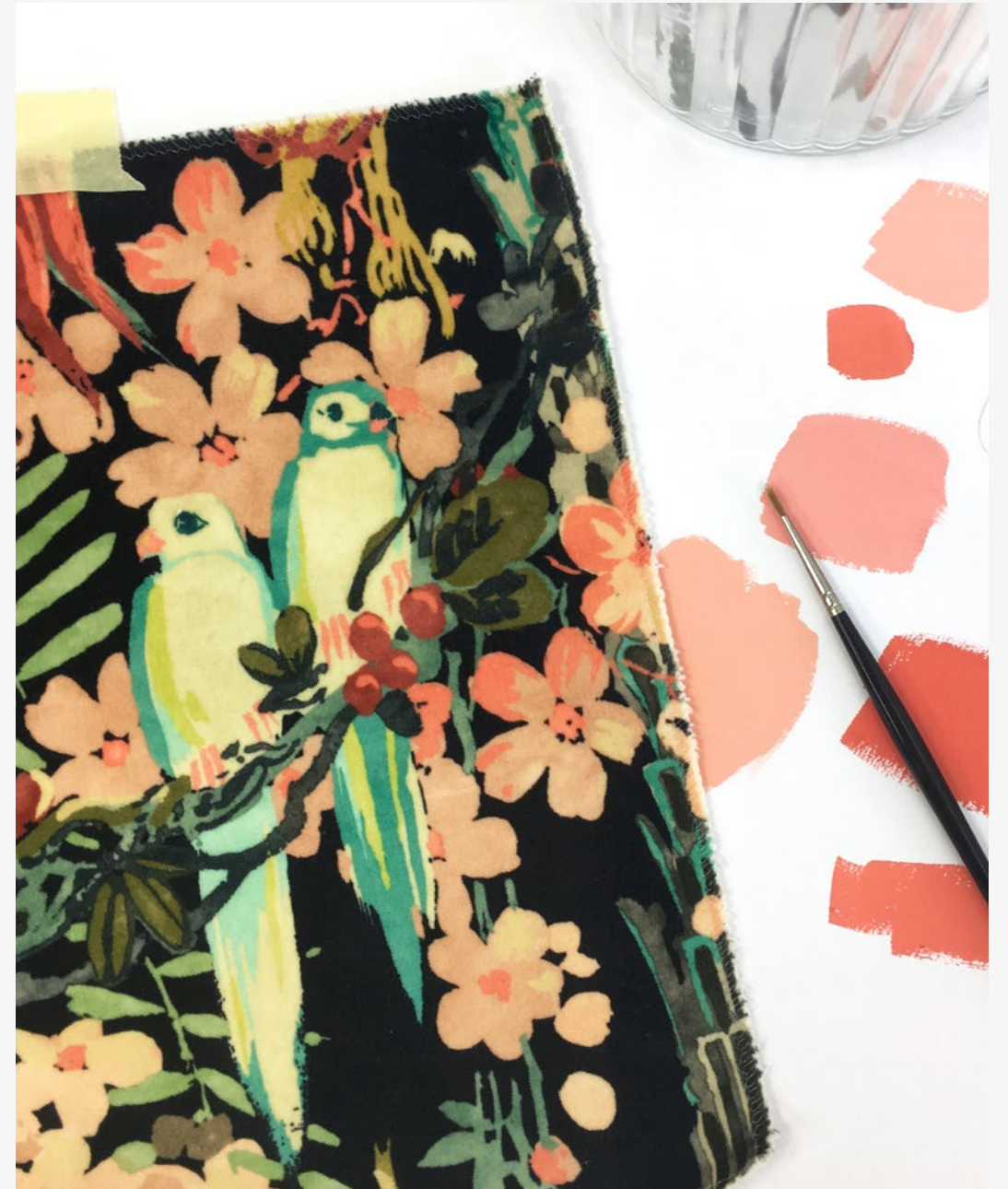
Tango - Rainforest Rabble