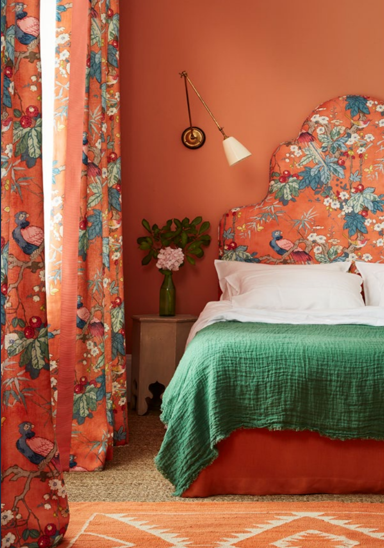
Belleville - Miji