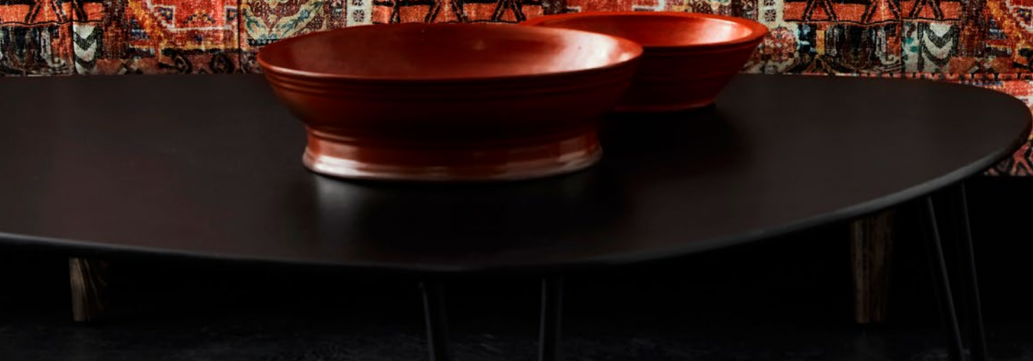
Omega Prints II - Fez