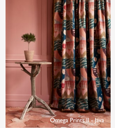
Omega Prints II - Java

'At Linwood we only create superior fabrics and wallpapers – it's what drives us every day. We review, test, trial and inspect each design, obsessing over every detail. Only when we're satisfied with the quality do we launch our exclusive collections.'