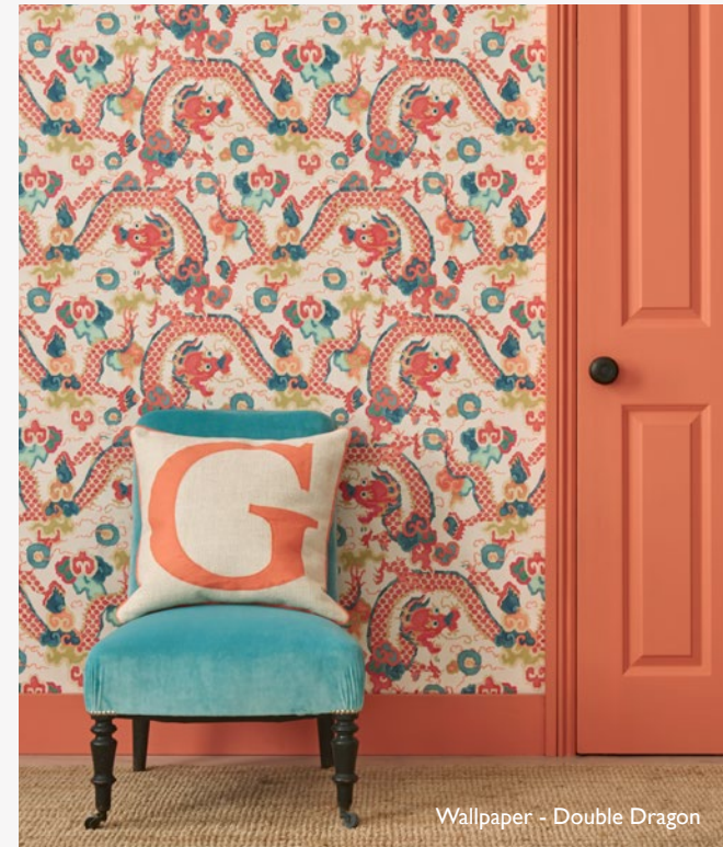
Wallpaper - Double Dragon