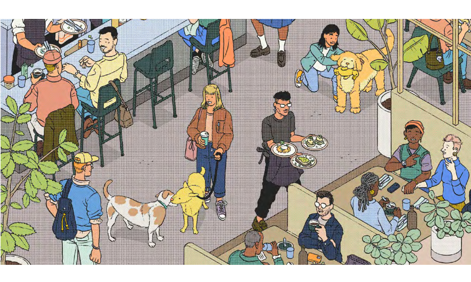
London, EC4M 7AW