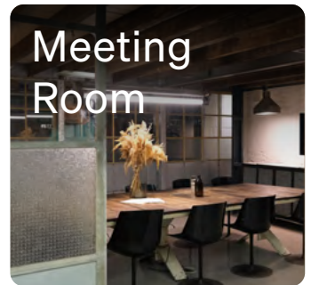
London, EC4M 7AW