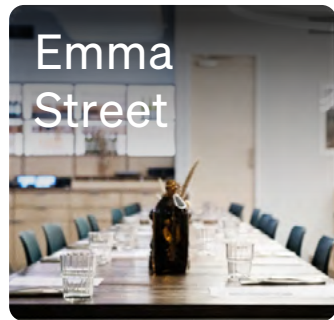
London, E2 9AP