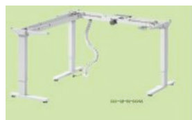
Everest Corner Workstations