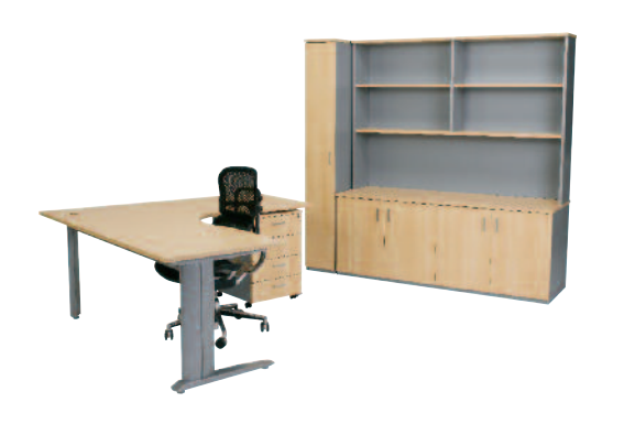
Symmetry Executive Cluster with Symmetry Furniture Items