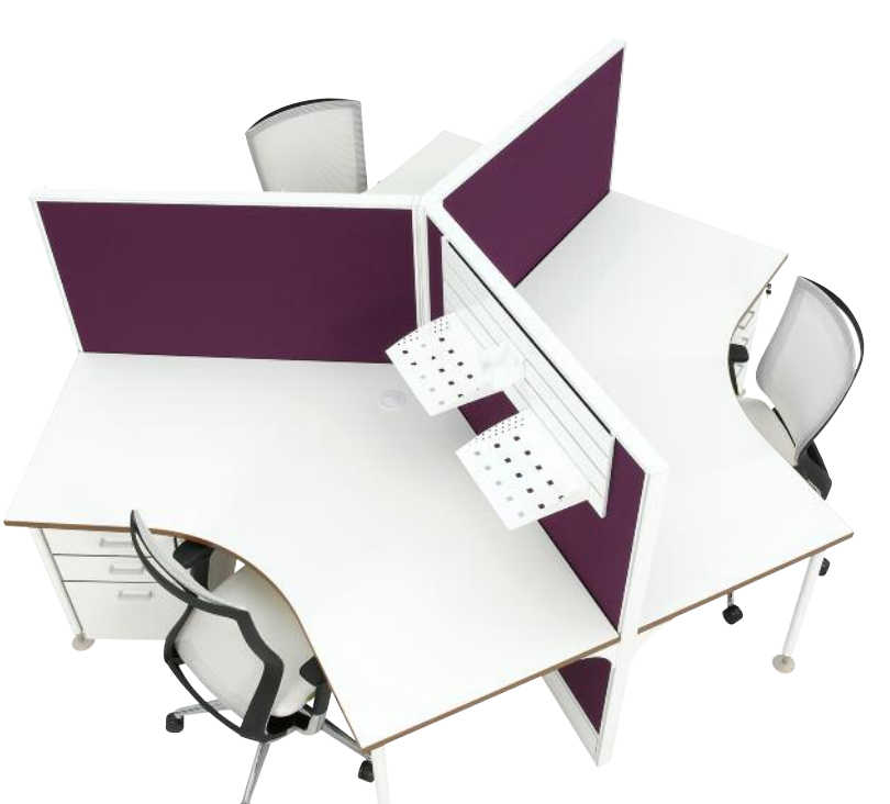
Hook on Pen Holders, silver