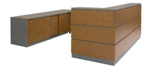
Symmetry Deluxe Reception Counter