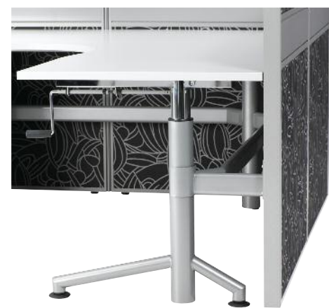
Velocity Highrise End Leg and Cubit 50 Screens showing the Velocity Screen to Frame Bracket