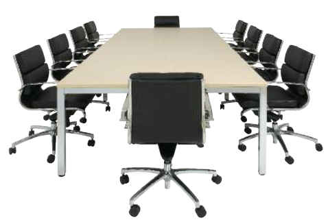
Cubit Boardroom Table with Chrome Frame