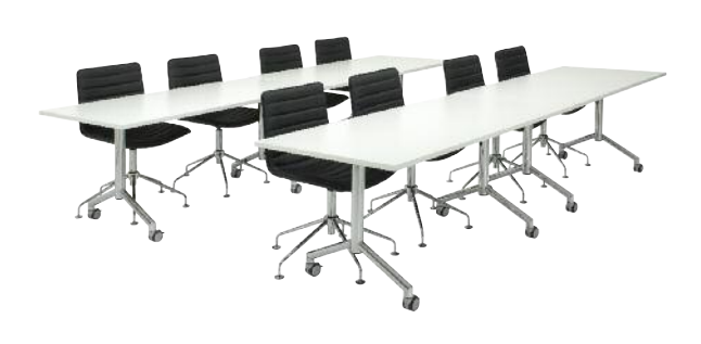
Velocity Flip top tables with Chrome Frame