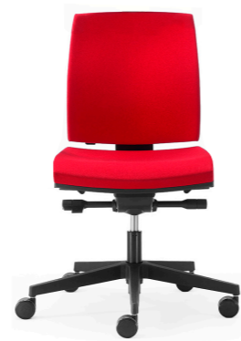
KINETIC Mid back