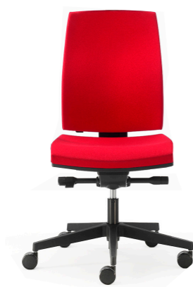
KINETIC High back