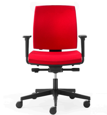
KINETIC Mid back with arms