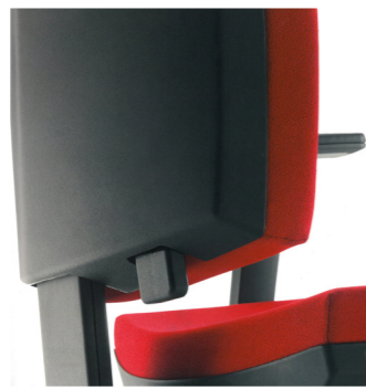
— Unique button back adjustment