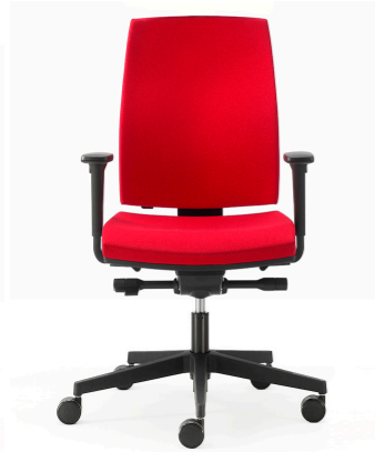
KINETIC High back with arms