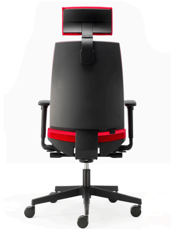
KINETIC High back with headrest