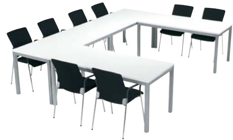
Cubit Training Tables with Silver Frame