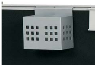
CAHO Card Holder