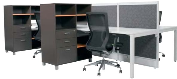
Cubit 50 4 Person Straight Cluster with Jigsaw Storage Units