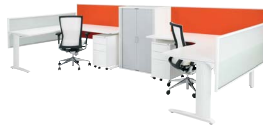
Symmetry Smart 2 Person Corner Cluster