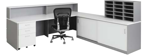
Symmetry Operator Reception Counter with Sliding Door Buffet and Pigeon Hole Unit