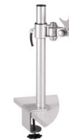
DMMA Desk Mounted Monitor Arm