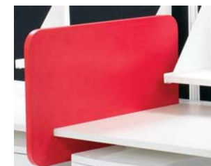
DIVIDESC Slip on Divider Screen