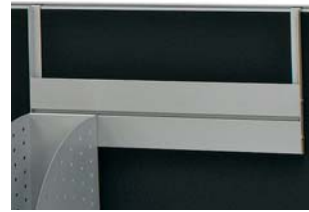
HOACCPA-750 Accessory Panel