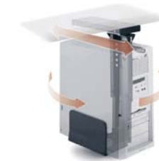
DMCPUH Desk Mounted CPU Holder