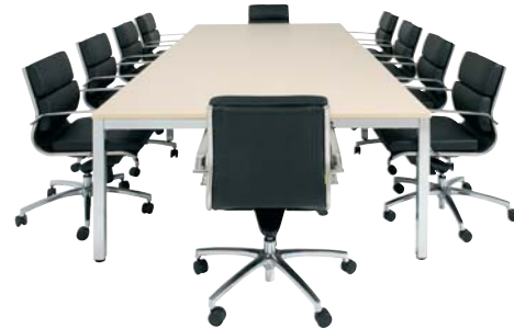
Cubit Boardroom Table with Chrome Frame