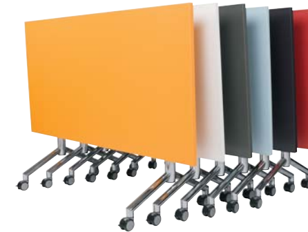
Velocity Flip top tables with Chrome Frame