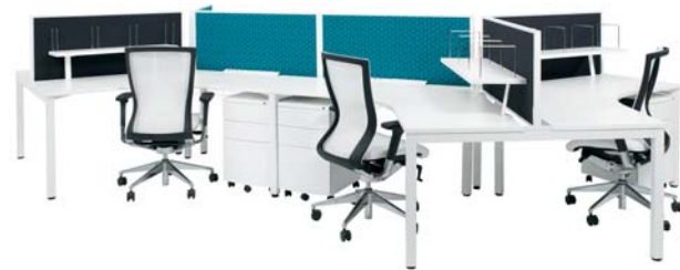
Cubit Smart - 120° Workstations