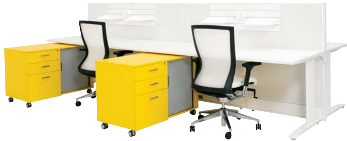
Cubit 50 - 6 Person 120° Workstation Cluster White Powdercoat