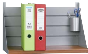
CBSMA6 Cubit Screen Mounted Accessory Shelf