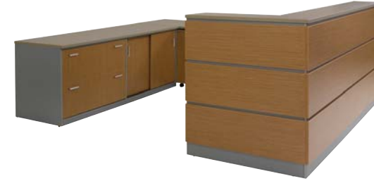
Symmetry Deluxe Reception Counter