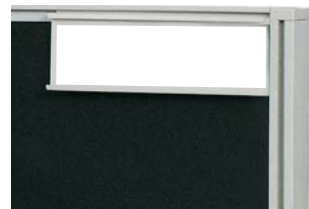
NAHO Name Holder