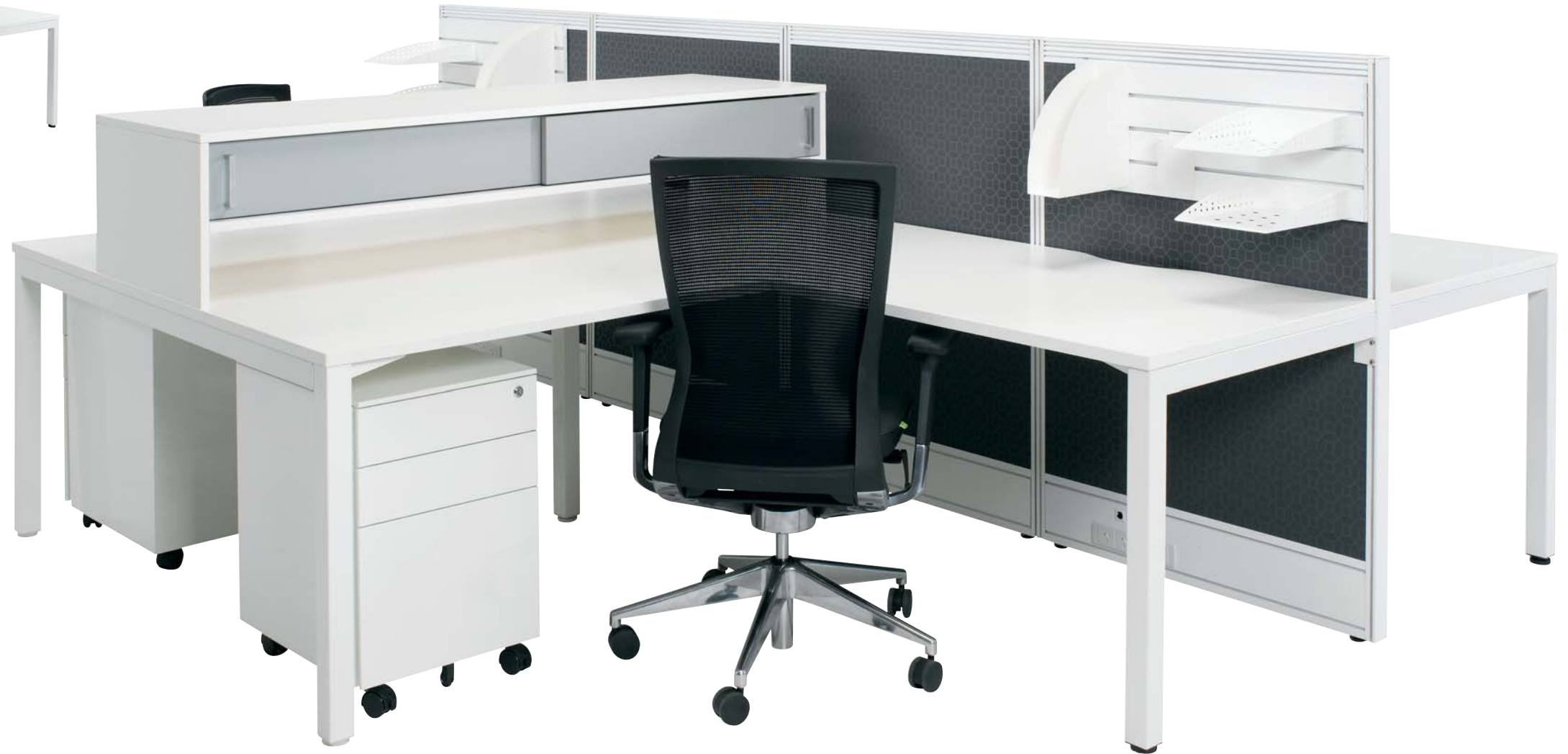
Cubit 50 2 Person Corner Workstation Cluster with Divide Storage unit