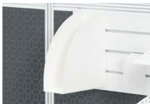
BIHO Binder Holder