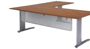
MEMOD-1500 Metal Modesty Panel