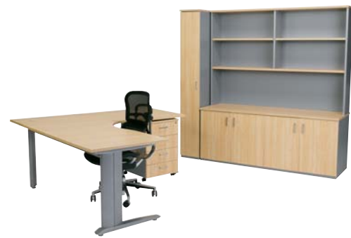
Symmetry Executive Cluster with Symmetry Furniture Items