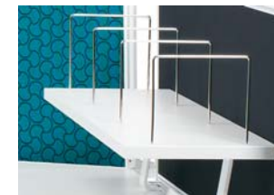
CBDMS75 Desk mounted Shelf with Chrome Wire Dividers