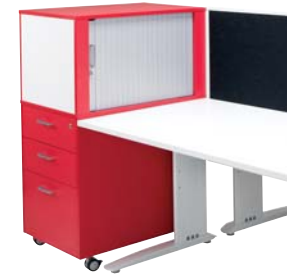
DSD0T01275 Designer Storage Docking Tower