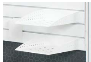
PATR Paper Tray