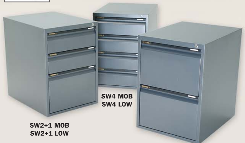
SW4 MOB SW4 LOW