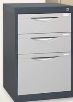
SWCH 2 + 1