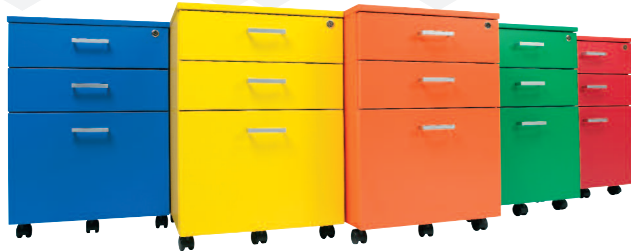
MP4BD Mobile Pedestal with 4 x Box Drawers