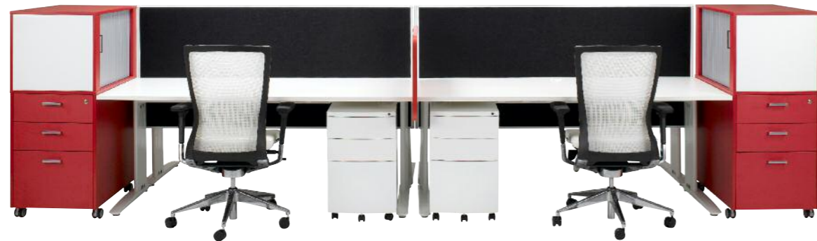
Designer Storage Docking Towers in Pillarbox Red with Symmetry Smart White Workstations.