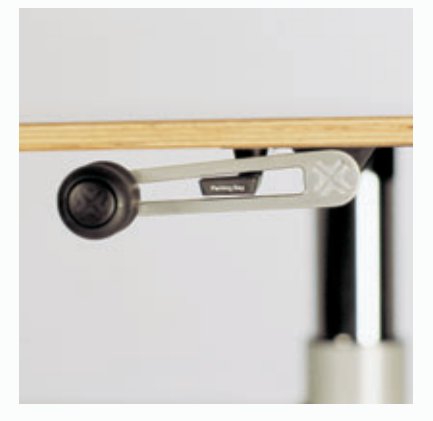
Handle detail with parking bay for resting handle when not in use

ALTITUDE<sup>™</sup> can achieve a height adjustment range of 400mm, from 610mm to 1010mm when using a 25mm thick work top. The standard height adjustment operation is via an easy to use ergonomic handle with optional electric adjustment available.