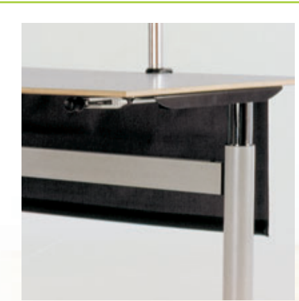
Perforated metal modesty panel