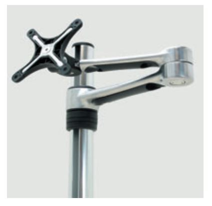
Available with Focus monitor arm

Accommodating all workplace applications, ALTITUDE™ has been designed to recognise the users needs while creating an aesthetic addition to the workplace.