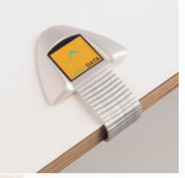
Optional electric operation is available with the slimline handle control unit