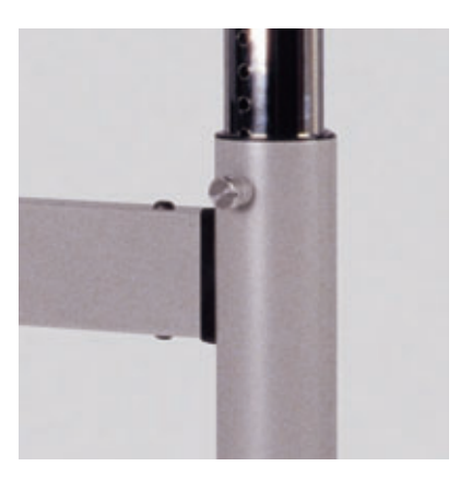
Pin and hole adjustment detail