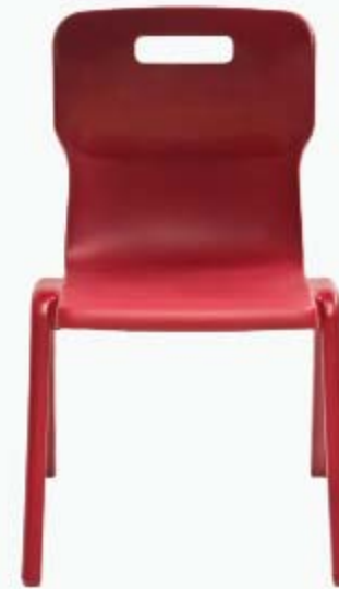
Titan 5 9-13 Years