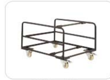
Blink sled base chair (only) FSBLITROL