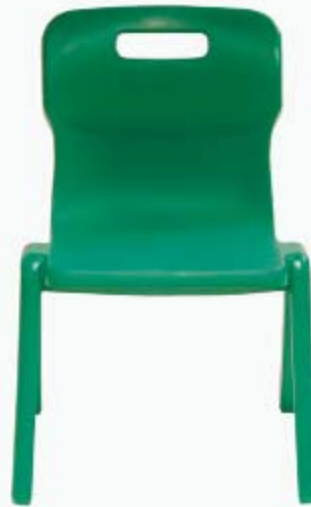
Titan 4 7-9 Years