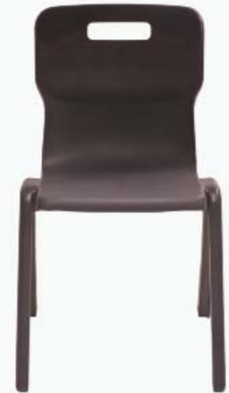
Titan 6 13+ Years