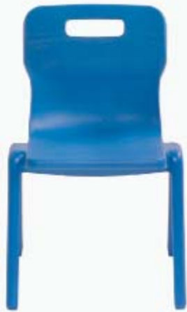
Titan 2 3-5 Years

CONFORMS TO EN1729 PARTS 1 & 2 IN THE UK