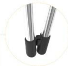
Durable Nylon P6 Graphite Linking Glides