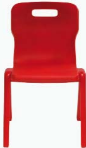
Titan 3 5-7 Years