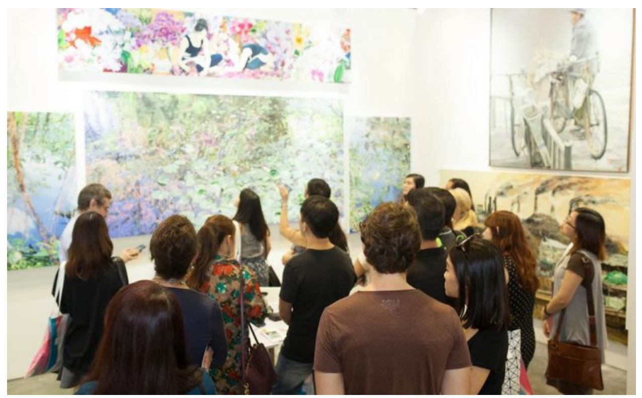
A host of complimentary talks, tours and live art demonstrations await collectors and buyers; the full programme and ticketing information is available from the <u>event website</u>, with more previews available from their <u>Facebook page</u>.

Here's a preview of what the fair offers.