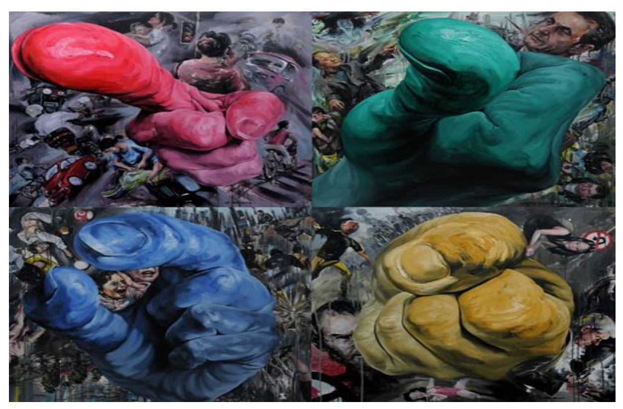
Gao Xiao Yun, China