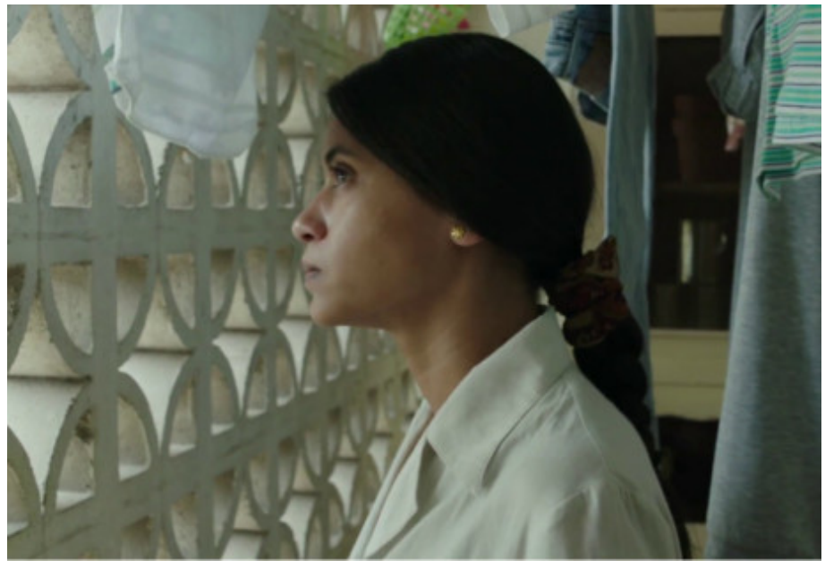
Film buffs: EUFF 2018 screens at the National Gallery this year