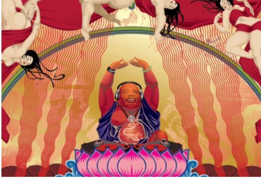
Where to get your art fix in 2018