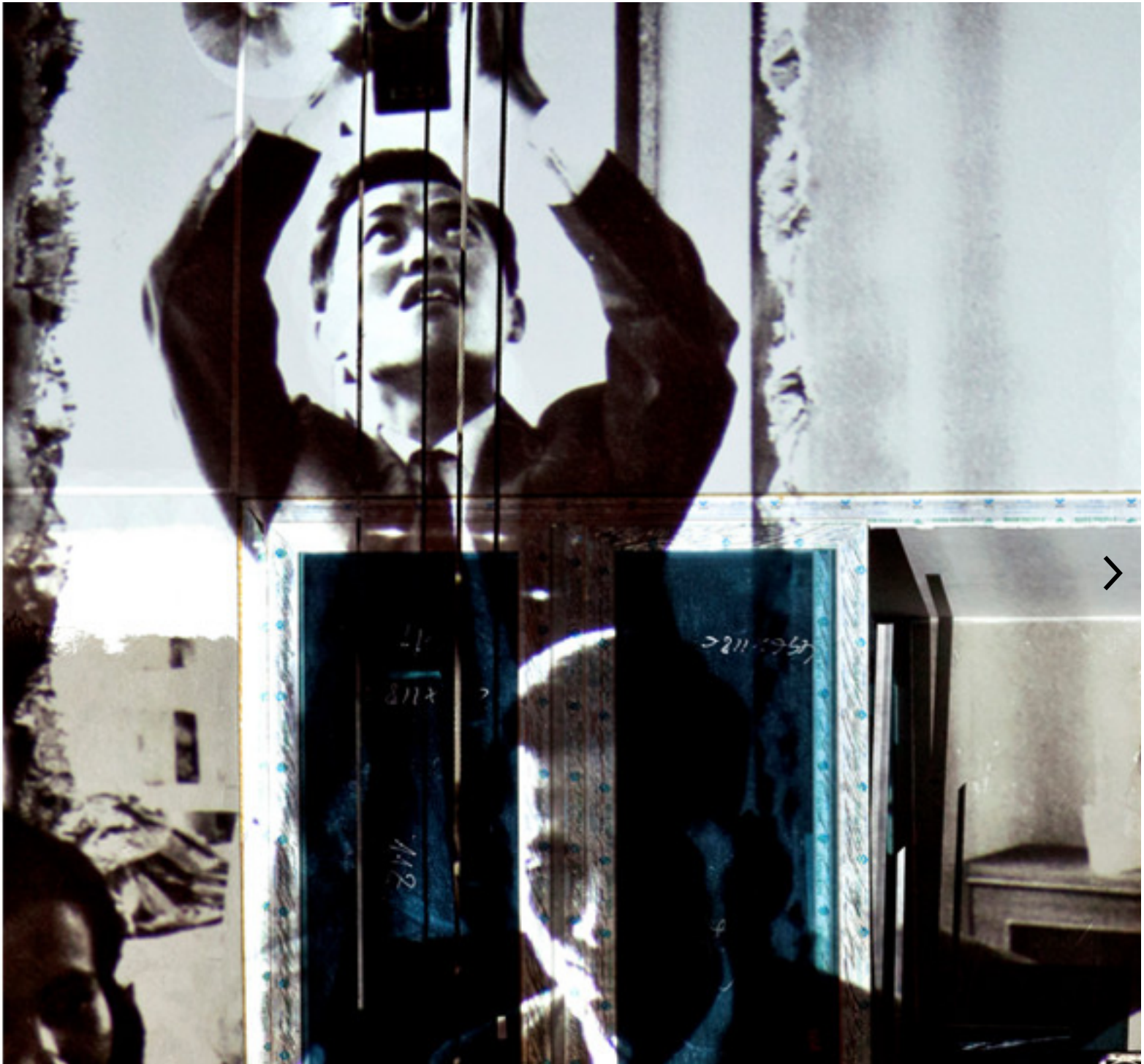
reCollection - The Mind's Eye (projected on an office building under construction, in An Phu

different interpretation on the art form. Instead, he juxtaposes the images of 44th US President Barack Obama and civil rights activist Martin Luther King Jr. in a single portrait – if you'd like to proclaim your love for two of the world's most prominent icons in history, this one's for you.