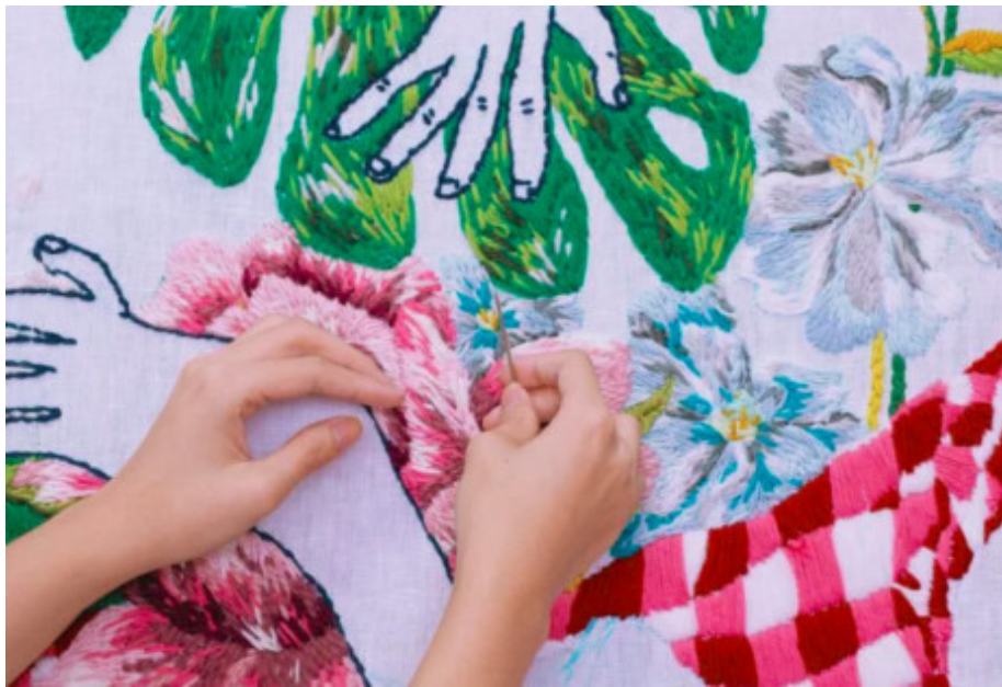
Artists pushing the boundaries of embroidery