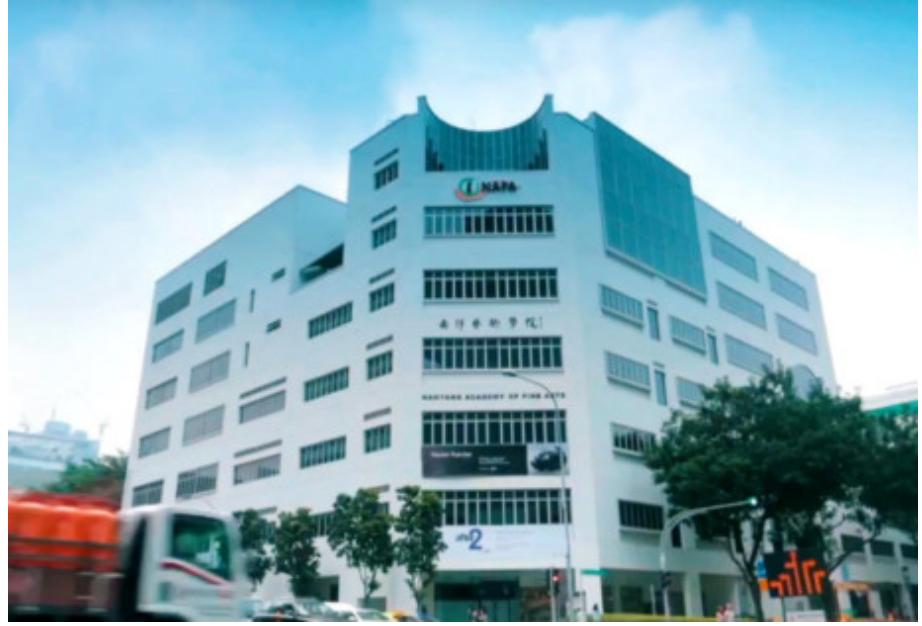
Art school not-so-confidential: NAFA Arts Festival 2018