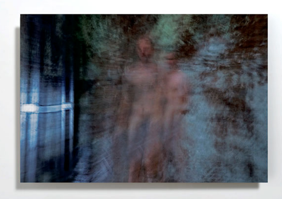
Flux Series 3 – Panel 5 by Kate Baker, Australia The images on display – priced between US$2,000 to US$20,000 (S$2,987 to $29,870) – are curated into four distinct sections: fine art, documentary, conceptual and mixed media. It will include works by 36 artists including Australian Kate Baker, whose ghostly images are an integration of photography, printmaking and sculpture, as well as French photographer Olivia Marty, whose pictures are a blend of photography, architectural elements and street art with a vintagey touch.