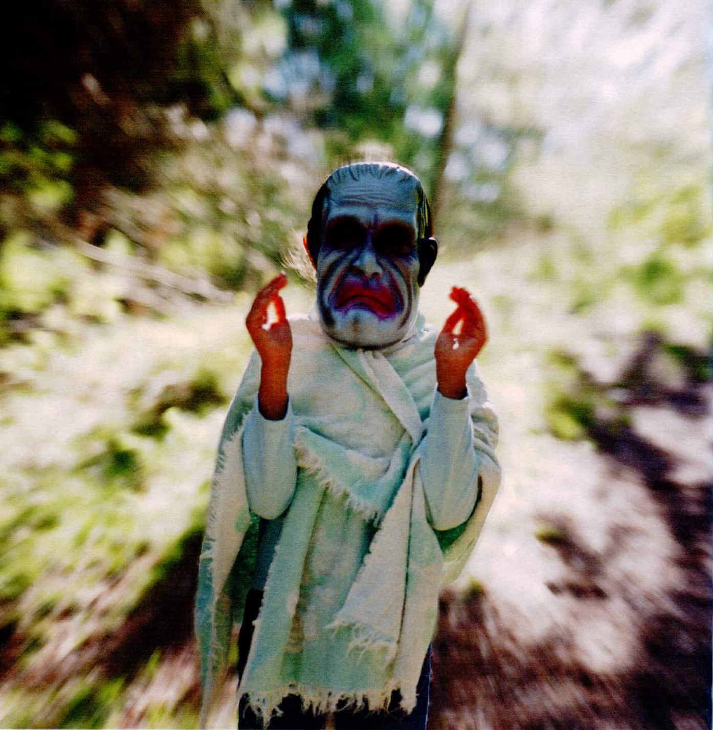
① Sad Frankenstein , 2006 — from the series Bittersweet ▲