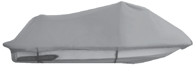
Rapids Deluxe PWC Cover (400100-7) Rapids Extreme PWC cover (400101-6)