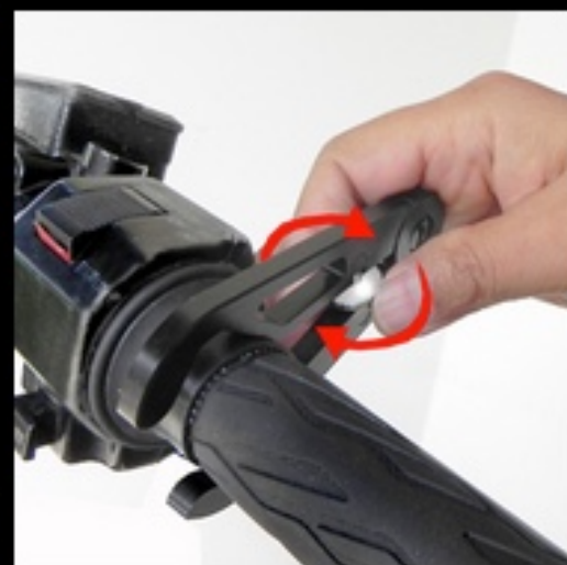
Turn the tension gear, the clamp will open or close both sides simultaneously