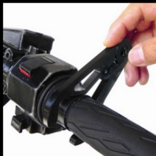
Slip Go Cruise on top of ring