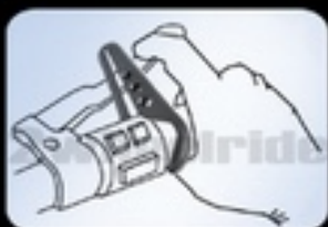
Reach the speed you want, the device is in high position