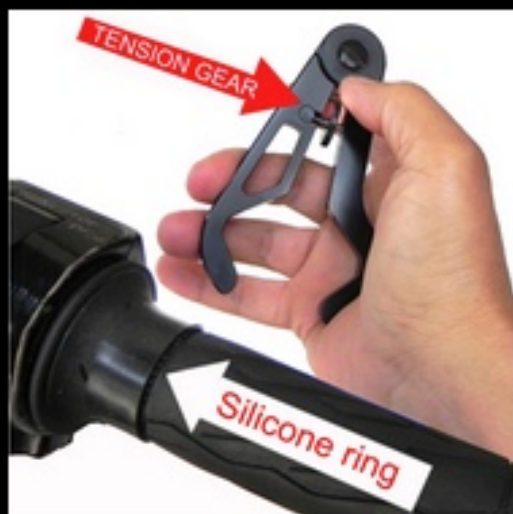
First put on the silicon ring