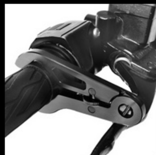
Push down to against the brake lever. Ready to cruise...

Clodwise to tighten Counterclockwise to loosen