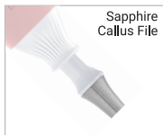
Sapphire Callus File

Remove hard skin and corns on the soles of the foot .