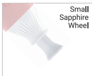
Small Sapphire Wheel

Remove calluses on the soles of the foot.