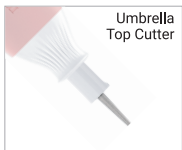
Umbrella Top Cutter

Thick and fragile nails trimming, grinding, and polishing.