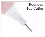
Rounded Top Cutter

Clean cuticle area and sidewalls. Clean dirt from under the nails.