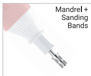
Mandrel + Sanding Bands

Thick and fragile nails trimming, grinding, and polishing.