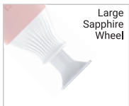
Large Sapphire Wheel

Remove calluses on the soles of the foot.