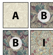
Block 1 Make 28