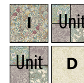
Block 2 Make 28