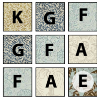
Block 3 Make 24