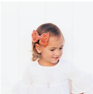
Chunky Vintage Velvet on a Clip Approx. 3.5 inch wide!