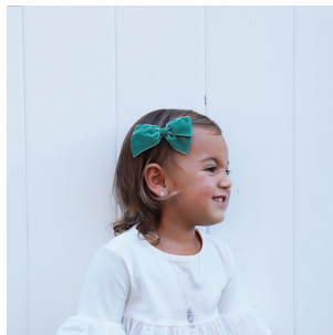
Vintage Velvet on a Clip Approx. 3 inch wide!