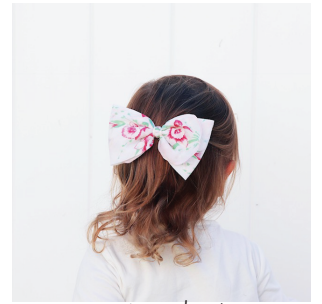
Vintage Mini Hankie Bow Avail. on Nylon or Clips Approx. 3-3.5 inch wide