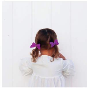
Teeny Vintage Velvet Pigtail set! Approx. 2 inches wide