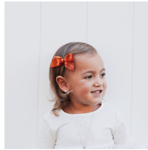
Teeny Vintage Velvet on Clip Approx. 2 inches wide