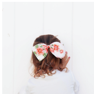
Vintage Hankie Bows Avail. on clips, only! Approx. 4.2 inches wide