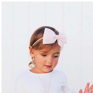
Chunky Vintage Velvet on a Nylon Headband Approx. 3.5 inch wide!