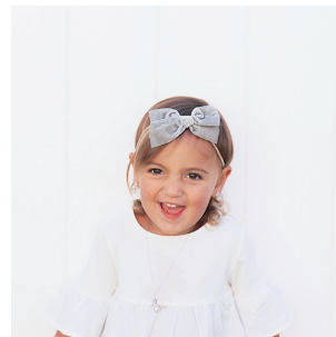
Vintage Velvet on a Nylon Headband Approx. 3 inch wide!