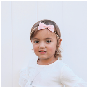
Teeny Vintage Velvet on Nylon Headband Approx. 2 inches wide