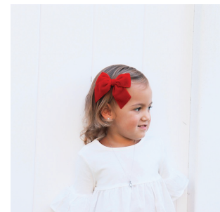
Vintage Velvet with Longtails Approx. 3.1 inch wide!