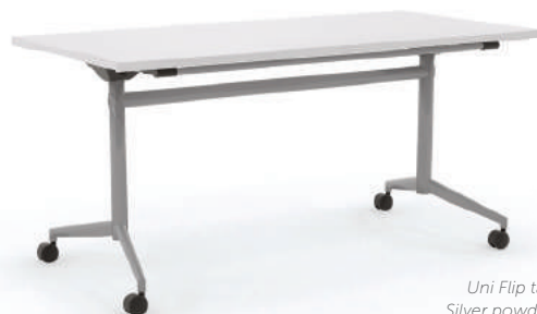
Uni Flip table in Silver powdercoat