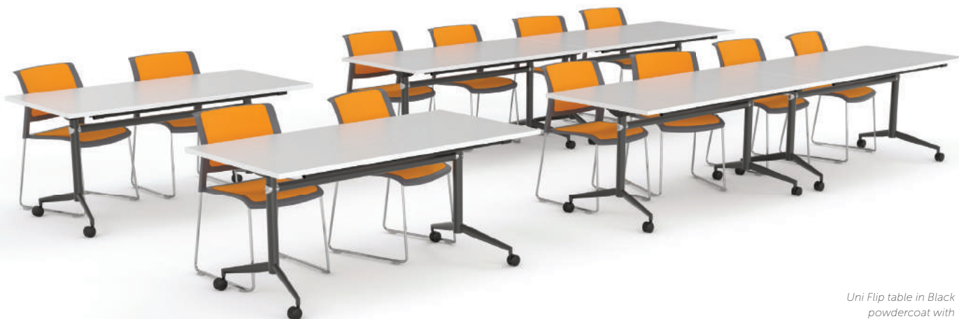
Uni Flip table in Black powdercoat with upholstered Game chairs