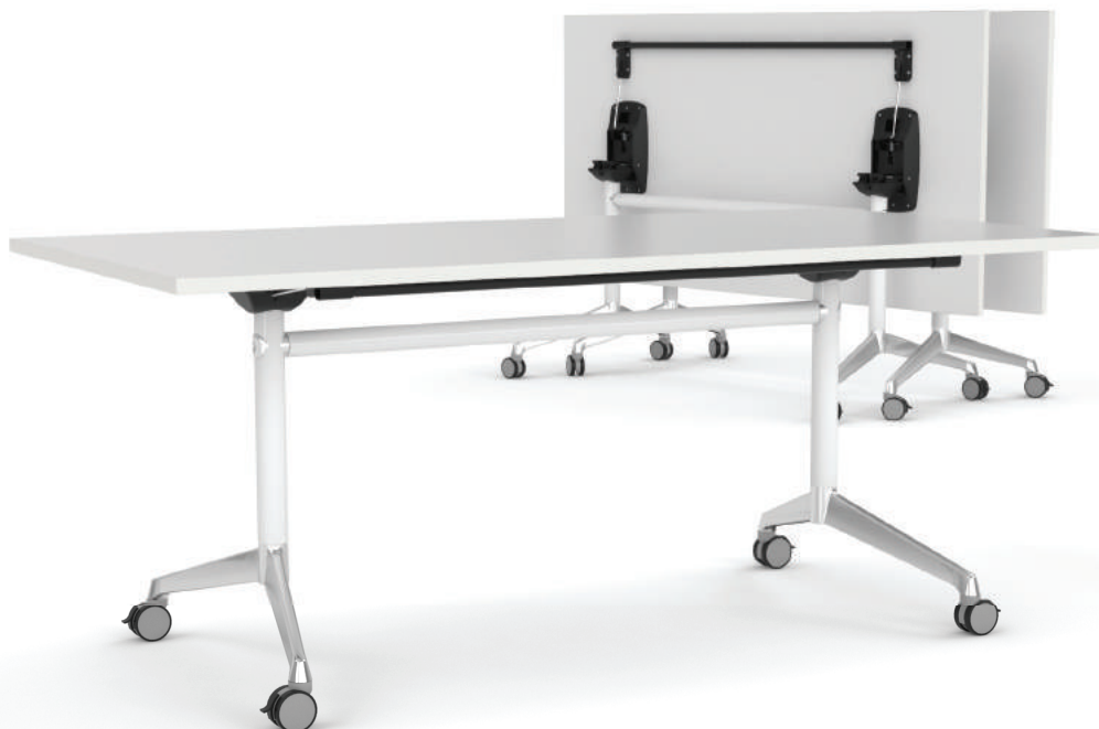
Modulus Flip table in Gloss White powdercoat