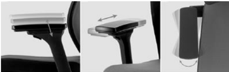
Optional 3 Dimensional Adjustable Armrests