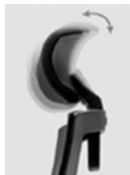
Optional Adjustable Headrest