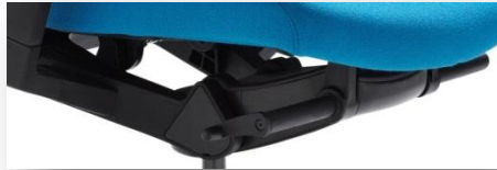
Advanced Dynamic Mechanism with EASY-Adjust Tension Control