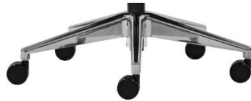
Optional Polished Aluminium Base