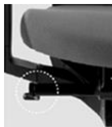
EASY-Adjust Tension Control